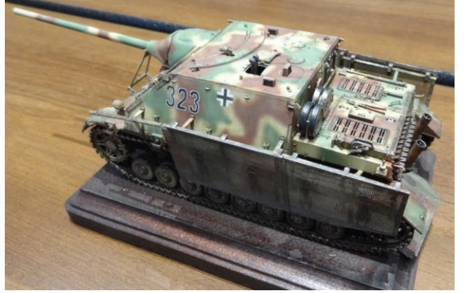
He stripped it