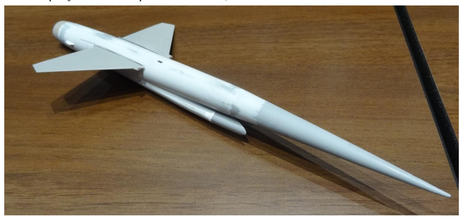
Greg Plummer used the Plastic Fanatic kit to build a 1:48 version of the LTV SLAM low-altitude nuclear-powered missile, designed under the codename Project Pluto. He said the casting was OK, but most everything was warped (just like the concept for the real missile!) and needed extra attention.

He built Tamiya's very nice 1:48 Ki-61 Hien as well, and gave it only a slight amount of weathering since it depicts a late-war plane based in Japan.