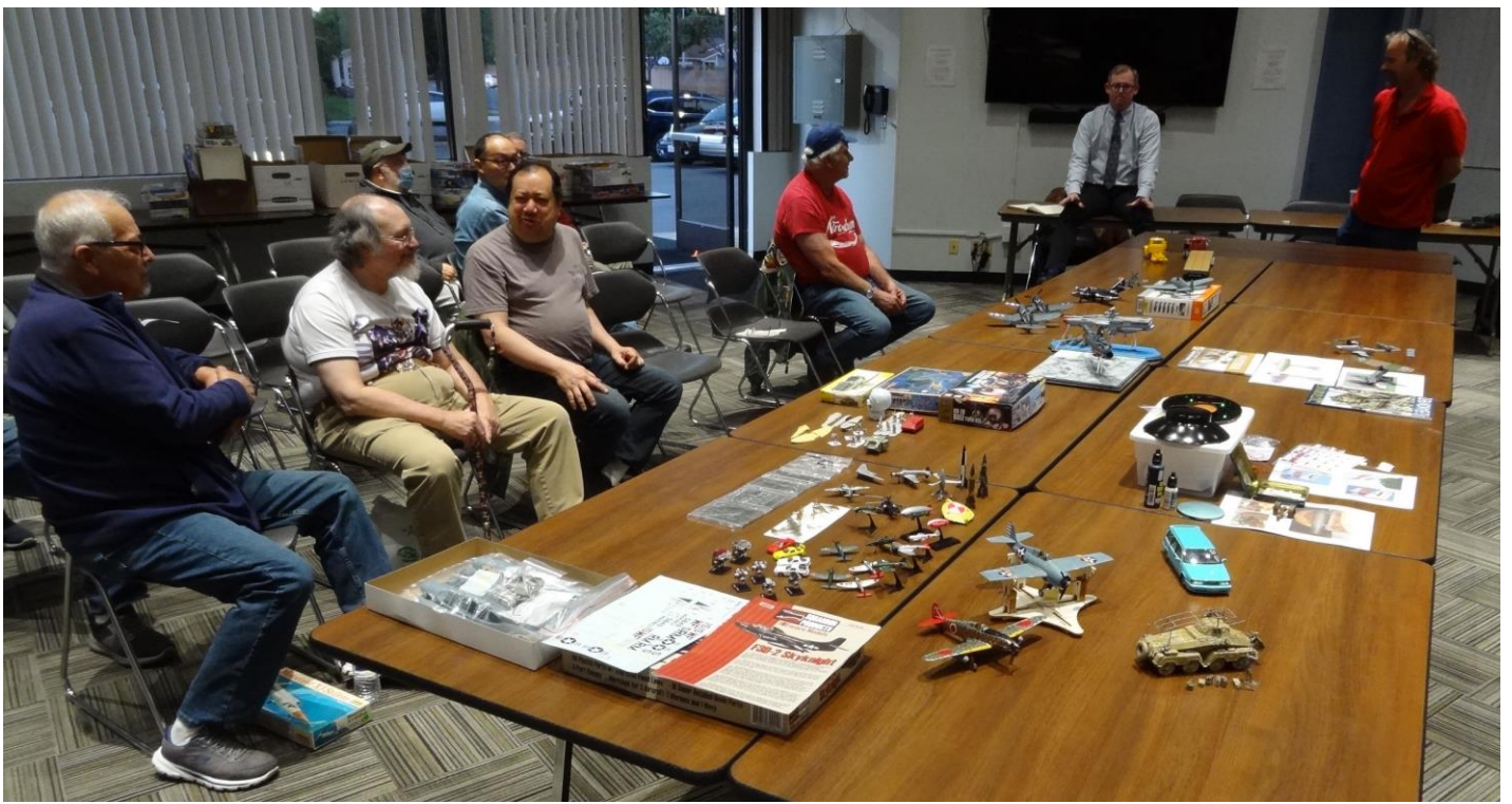
May We See How Things Turned Out ? Model Talk May 2023 Coverage Starts Here (cont'd from pg 1)