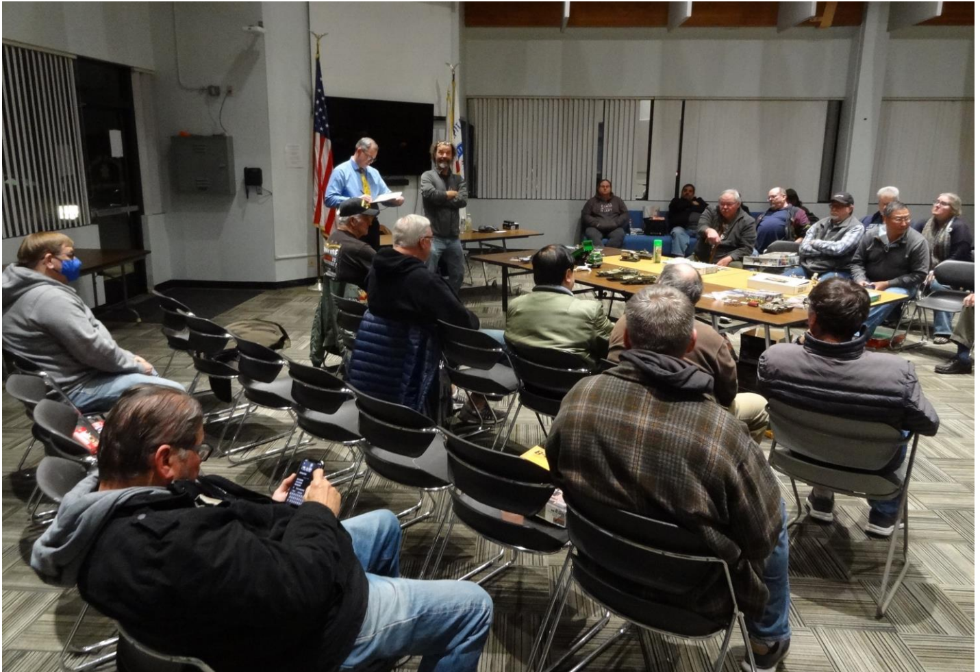
Aaah the sweet mood of the first meet for year...