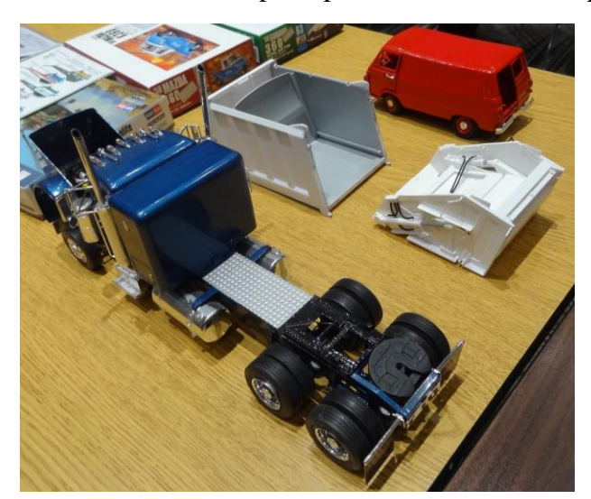
Kent McClure's plans include two 1:32 car kits from Arii

Cliff started with a pickup truck and used sheet plastic to convert the model to a van.