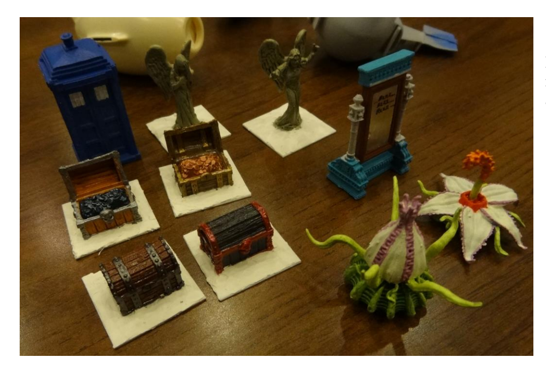
His "egging me on" though did occur, as his cream MiG-15, dove gray MV-22 Osprey, and one which even I could not safely identify, below: