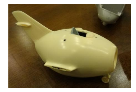
Kent McClure had again the means to show that not just an aircraft model night.