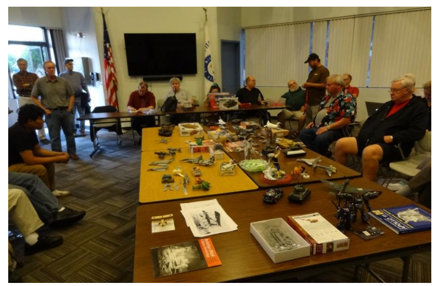
August Edition Is Super Compressed With All There Was To Cover From What Held Forth In July Meet (from page 1)

At the July meeting, we received news that the Nov. 2 contest aboard the U.S.S. Hornet had been canceled because of a change in the ship's staff.