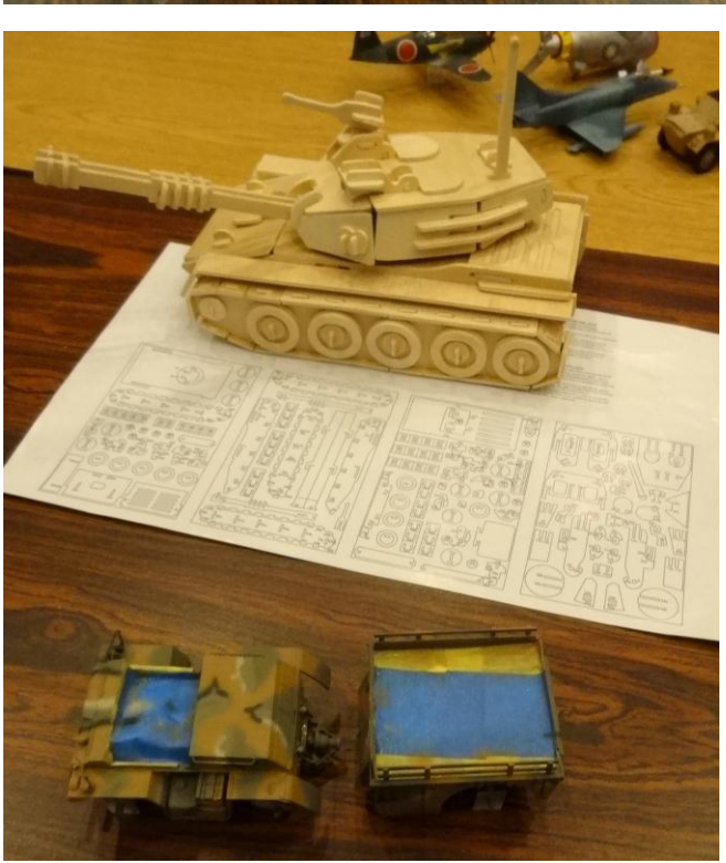
in intent perhaps.

Lastly, M60A US Army, from AMT/Esci kitting, and a set of AFV Club aftermarket tracks installed.