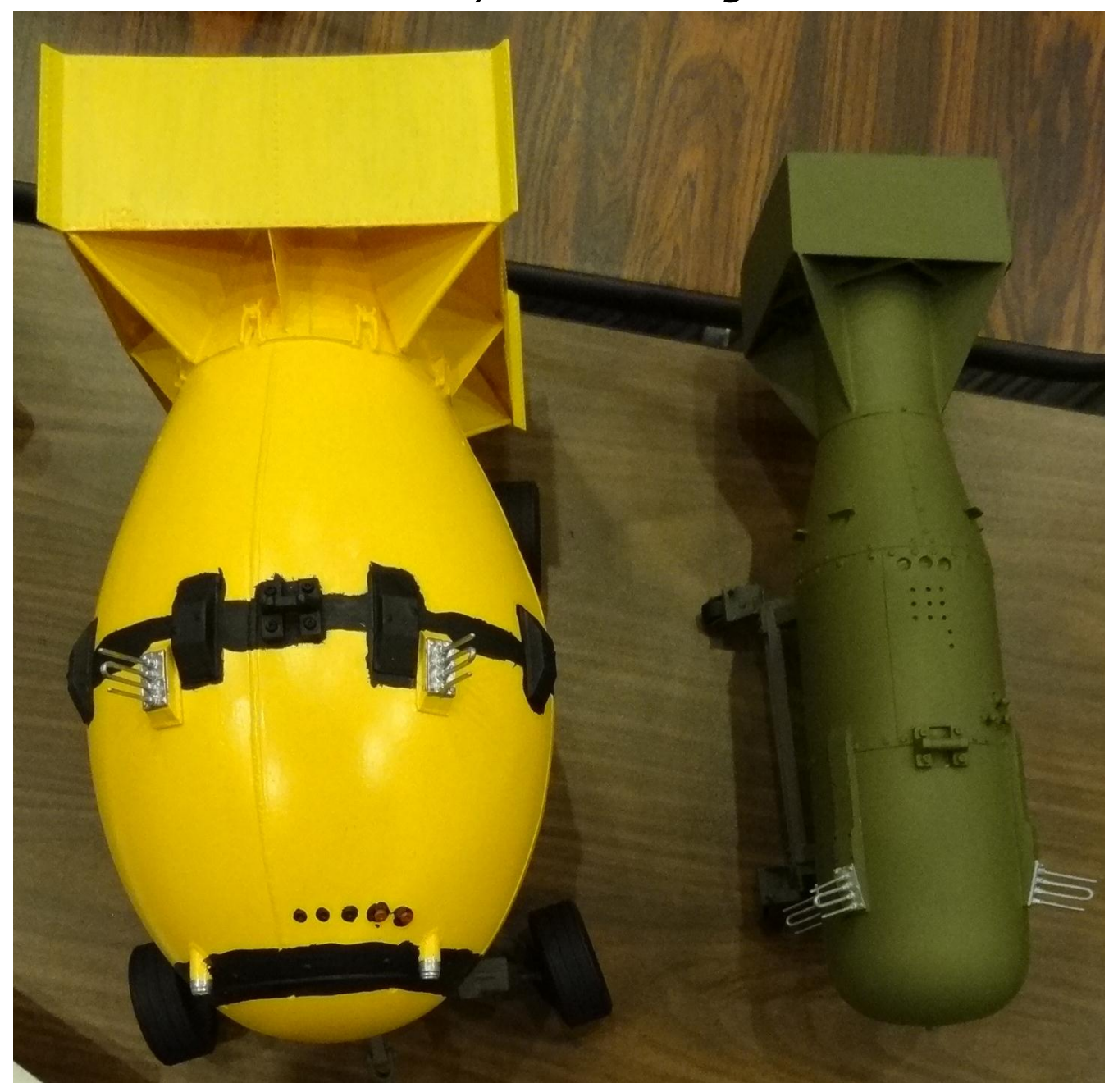
Editor Suffers Flash (Memory) Burn for this Recall of SVSM August 2015 Meet Text: Mick Burton Models: everyone but Mick Burton