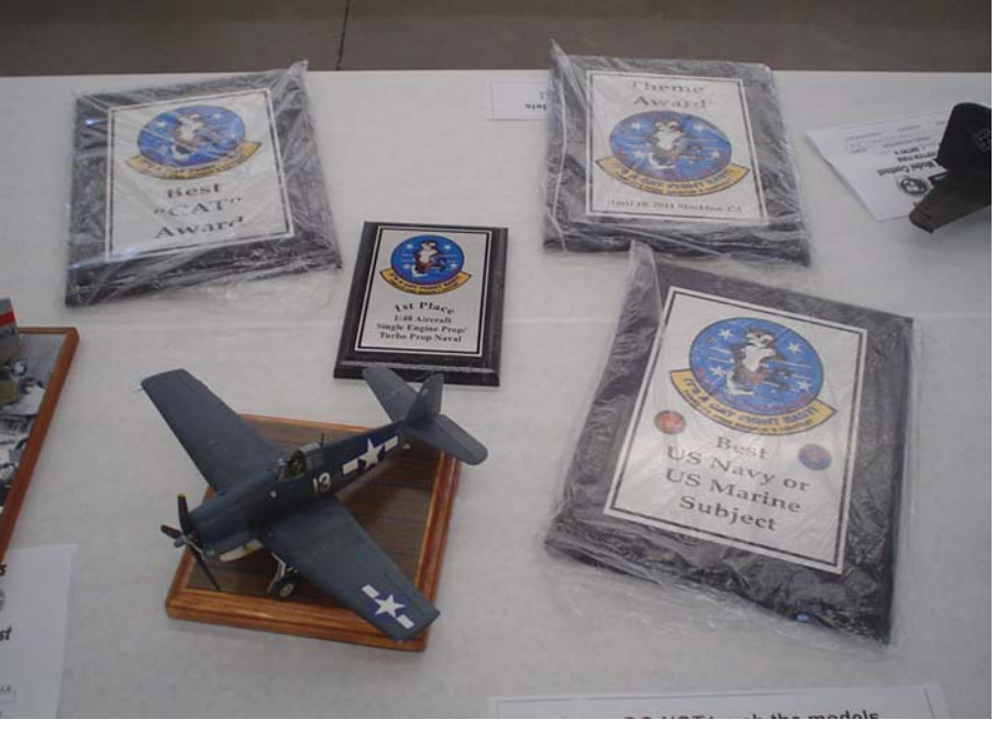
First in Category + Three Thematic Specials, GO GRUMMAN!