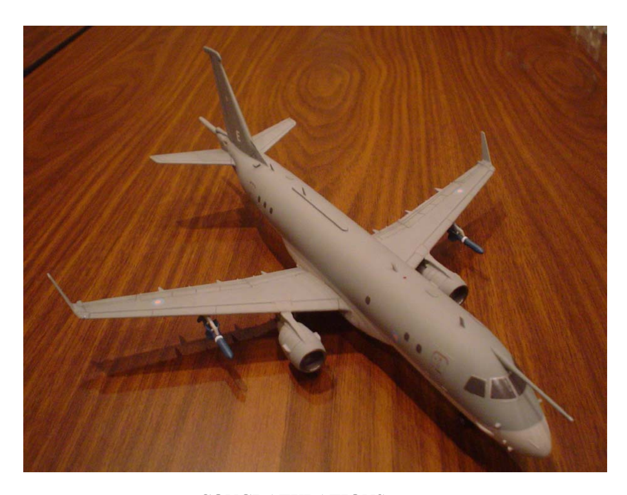
CONGRATULATIONS Gregory Plummer FOR WINNING MARCH MODEL OF THE MONTH