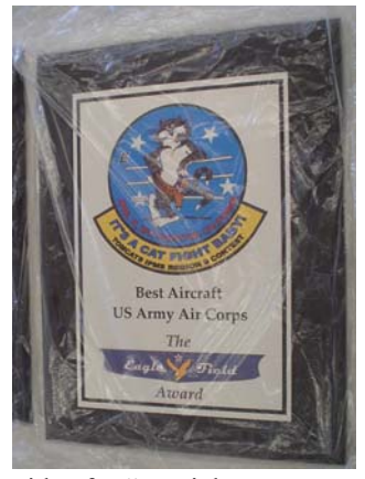
As promised, Tomcats had a great idea for "special award for Uber Competitors" Namely a "Sweep" Trophy. Next to it, another fine Special Award.