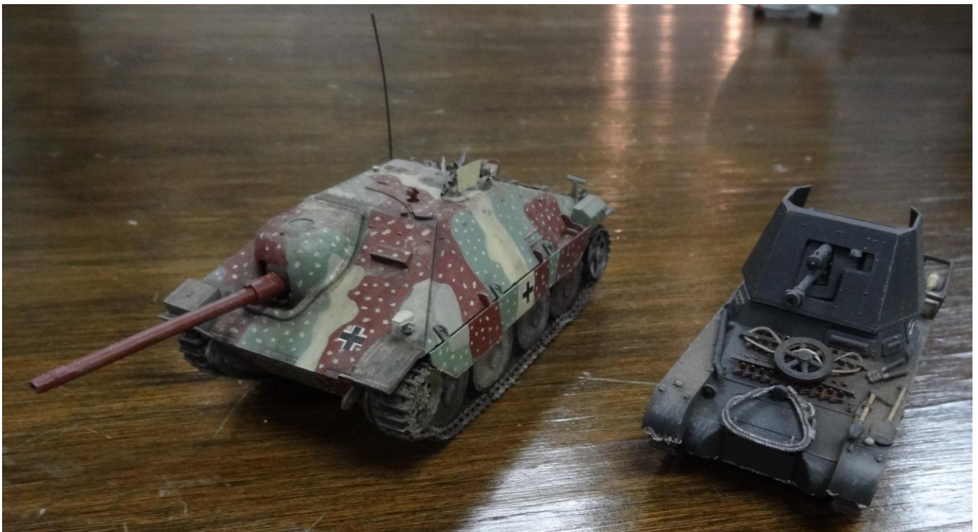
Mark Balderrama has an NB-52 mothership project in the works, with a 1:144 conversion kit from Cutting Edge and a Muroc Models X-38, which includes the proper cradle to mount it to the NB-52's wing pylon.