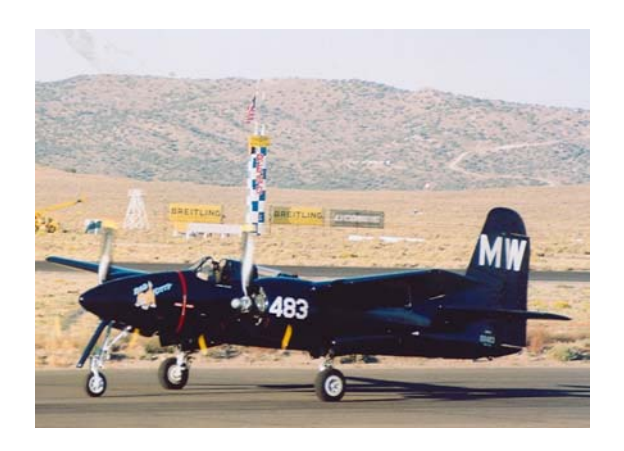
"Bad Kitty" taxis out to the active runway