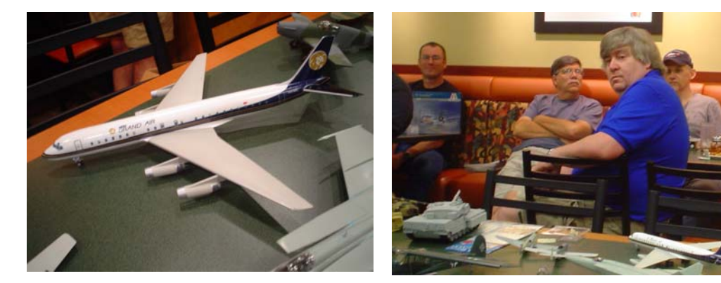
The evil editor provides "scale" by using hapless bystanders plus author in photo

Overall this model was a fun build of a pretty unique plane. I'm almost certain I'll never fly in luxury so the next best thing is building a model of a luxury jet and then dreaming about flying in it.