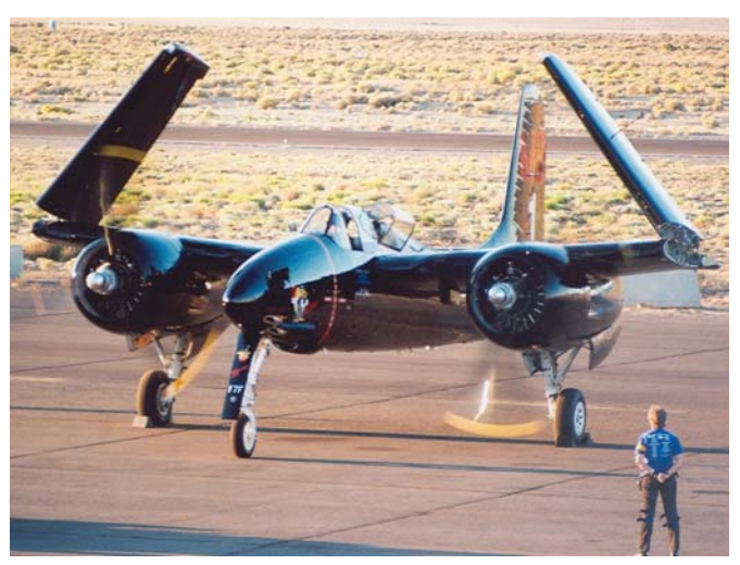
Mike Brown gets ready to shut down race #1 To watch Tigercat round the pylons is way cool