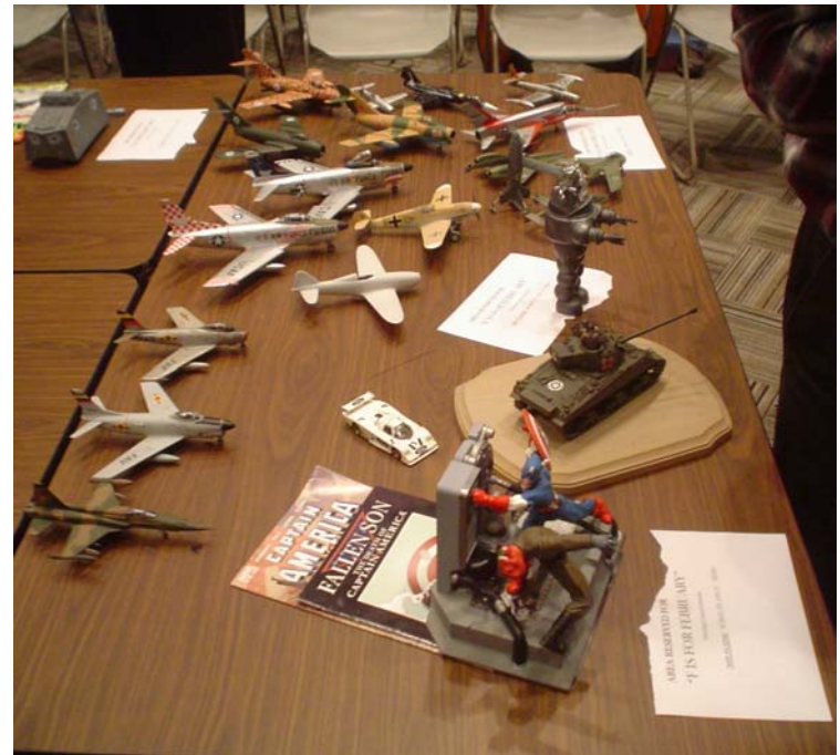
"F-ed Up Fun": Look back at our February 2010 Club Contest