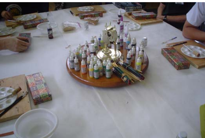
At left, the "Unfinished" category, one I have won in myself and judged (even split, once!). It's something you have to try, to understand. Above, the "Speed Build" before we began ...