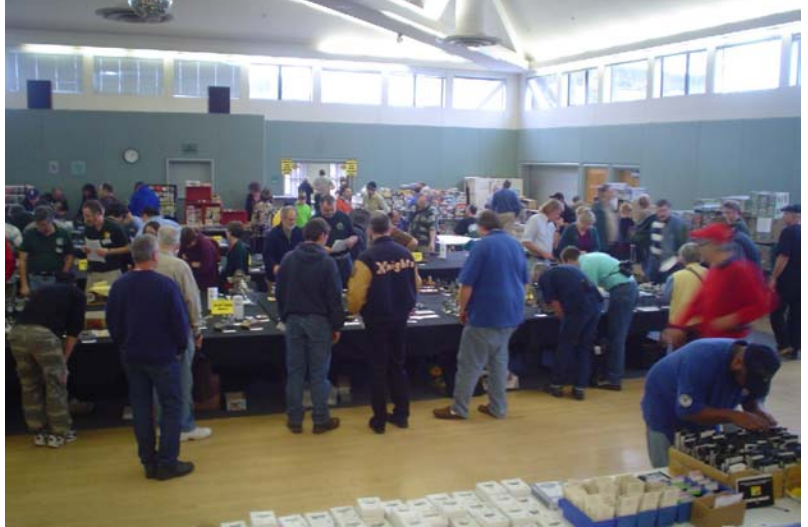
One last pic of how it looked to me from the stage mid-day... Plus how "Speed Build" category shaped up ~ all ten