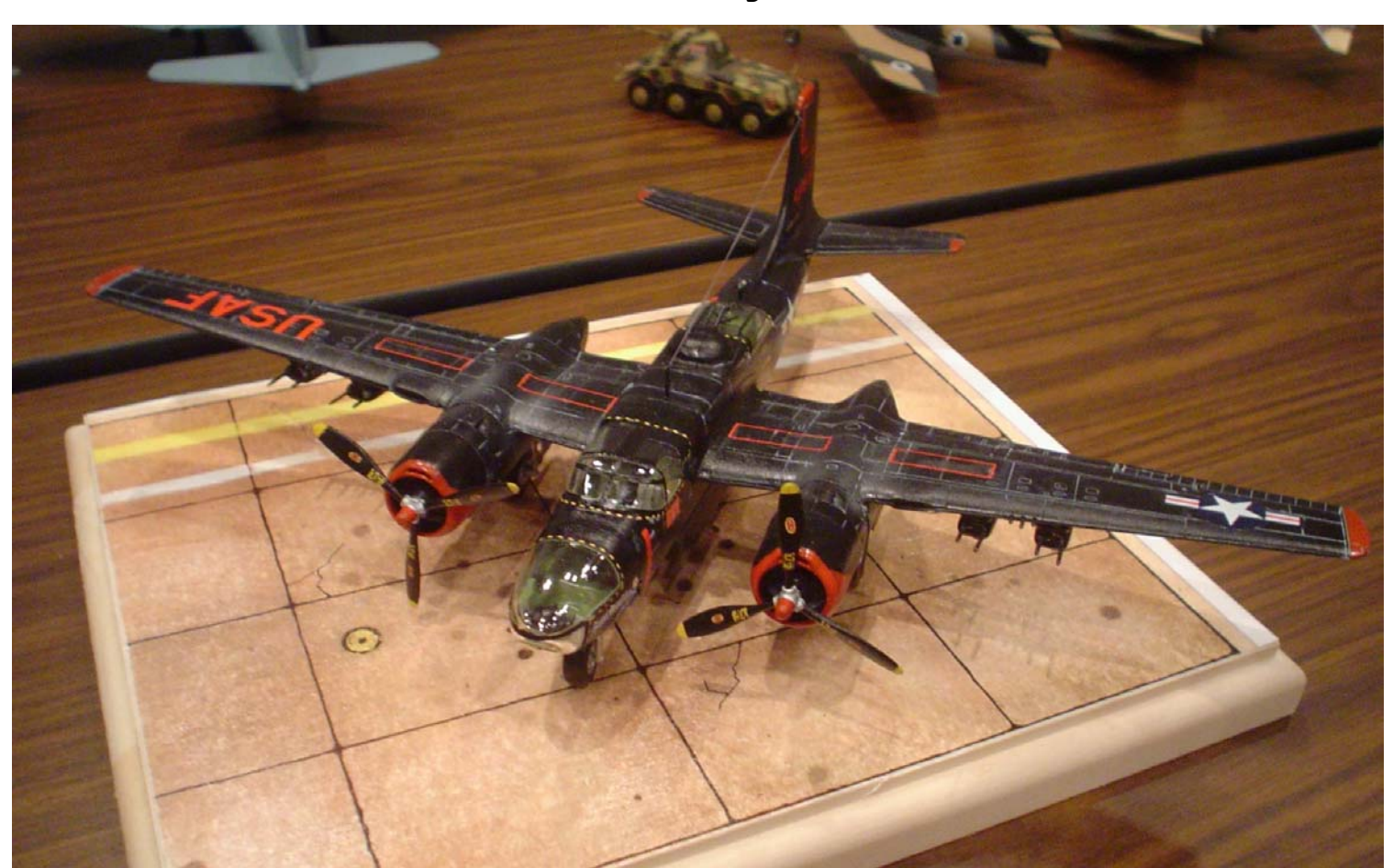
FOR WINNING FEBRUARY MODEL OF THE MONTH