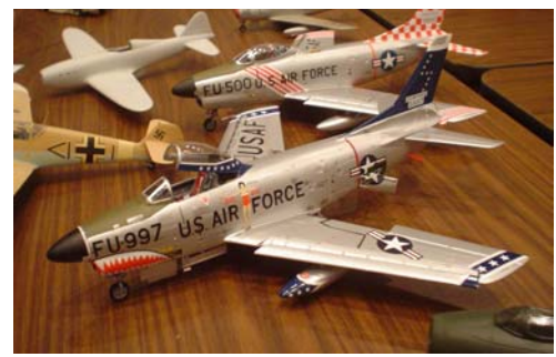
Read left to right or from up-down, they're real First, Second and Third placers.