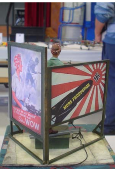
This shot taken from the stage as SilverCon 2010 still getting underway...filled in a lot! - mick fini