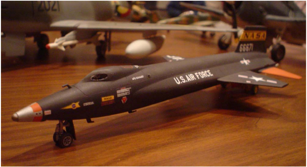
First Place for X-15A-2 (modified) 1/72 scale Monogram, by Jim Priete