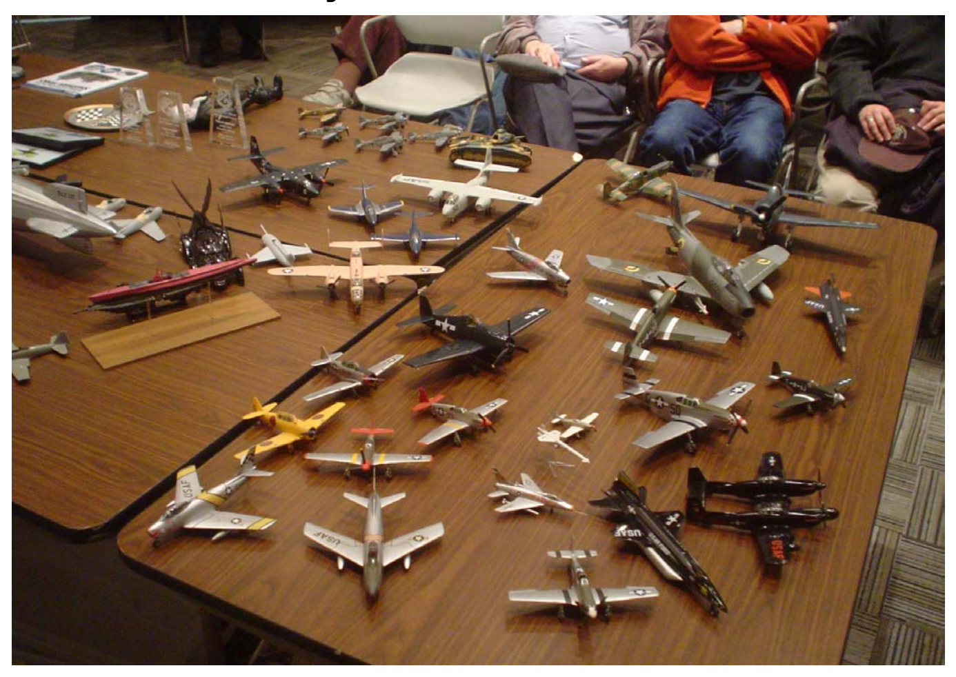
Field of Battle for our last "model meet "for 2010, didn't disappoint when it came to turnout, did it? We definitely managed to turn up some North Americans and Grumman Iron, eager to take editors money!