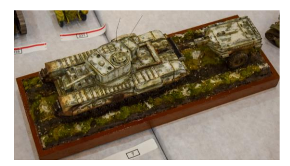
On left is Entrant # 2, entry 7, again now I do know roughly what it is but no idea what category

Okay here is "Entrant #2 entry 6 " of which I still need to confirm what category it was in, to start off