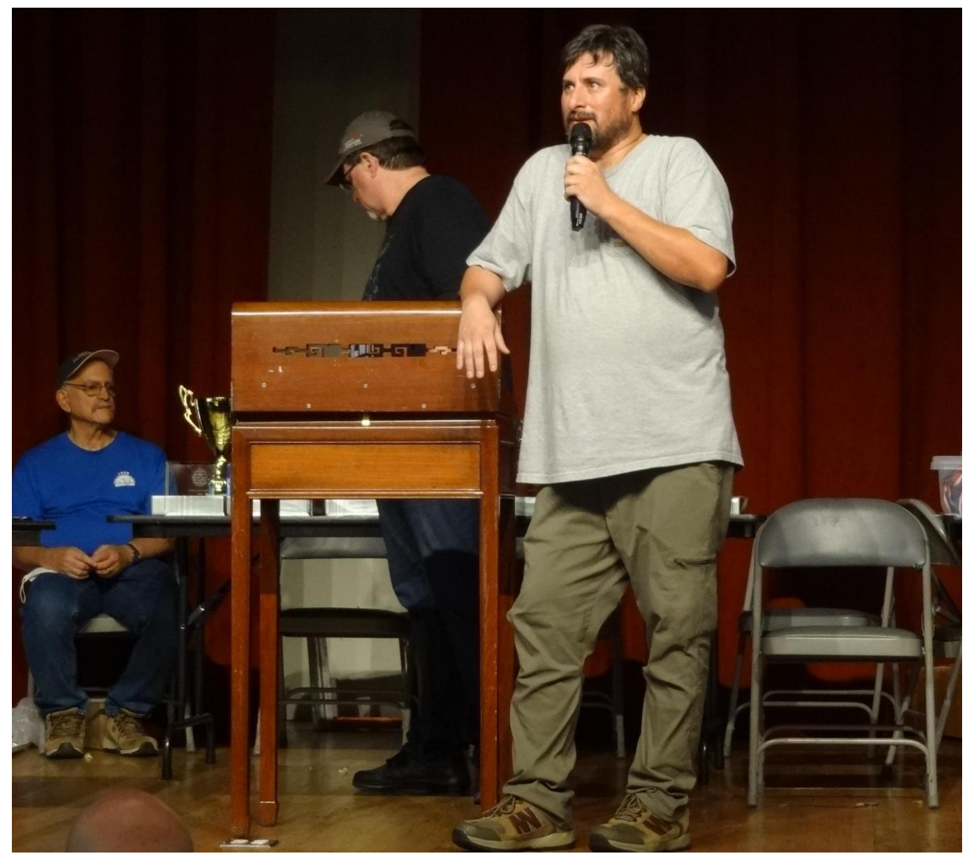
AND THE CONTEST DIRECTOR'S SIGN OFF MESSAGE FOR SPECIFICALLY SV CLASSIC # 7

After two years of waiting and rescheduling the SVC 7 finally happened and I feel so relieved that it's in the books.