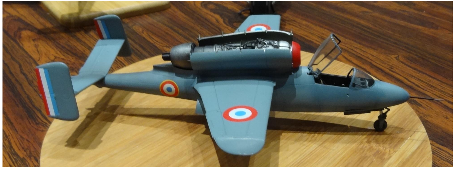
Greg Plummer's He 162 wears distinctly non-Teutonic colors, being depicted as an example captured by the French at the end of the war and then used for engine development. Did you know the He 162 led to the creation of the ATAR that ended up in various Mirages and the Etendard?

Now you do! Greg used the 1:48 Dragon kit and added seat belts to the cockpit.