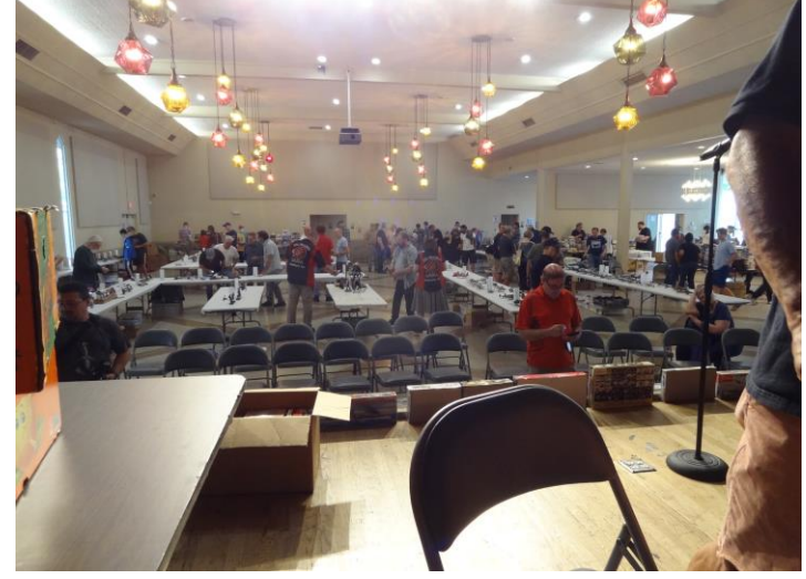
Vendor room seemed to have filled with opportunity, oh yes

From the stage, several views out into the engaged modeler community, well in process of viewing, conversing, taking