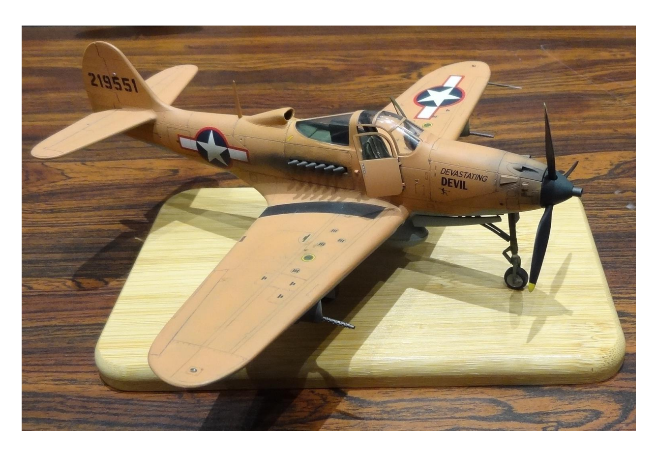
Congratulations to Greg Plummer FOR WINNING AUGUST MODEL OF THE MONTH