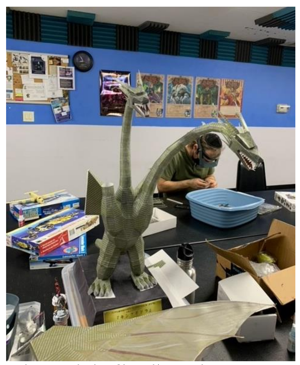
Who Were Those Masked Folk? Editor Makes Game Try At Guess Text: Mick Burton

During the month of 2022 January... We actually had something approximating a New Year's opening meeting "in person", albeit on the 4th Monday of the month, after having the plan for 3<sup>rd</sup> Friday blown all to hell by yes, latest reactions to ongoing pandemic. Editor didn't make meet... Let's see on page 3