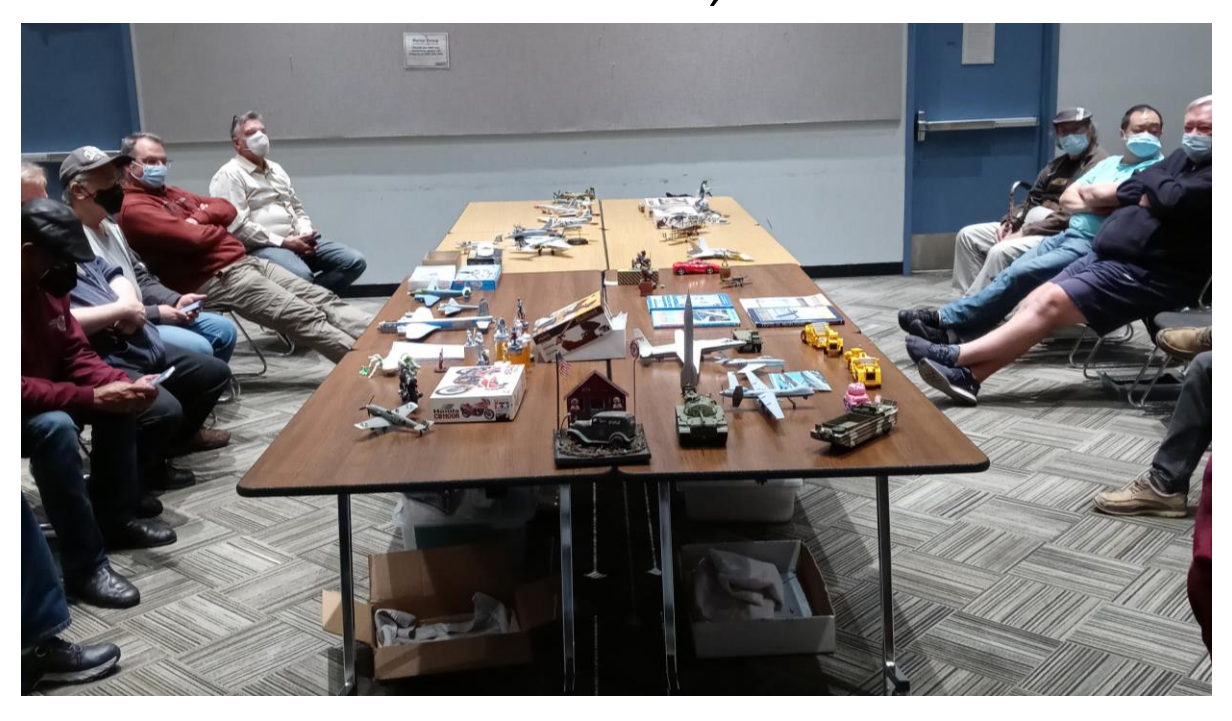
Editor Makes It To Both, However Did Not Get Much Recorded At One, Got None at Other. Let's see on page 3