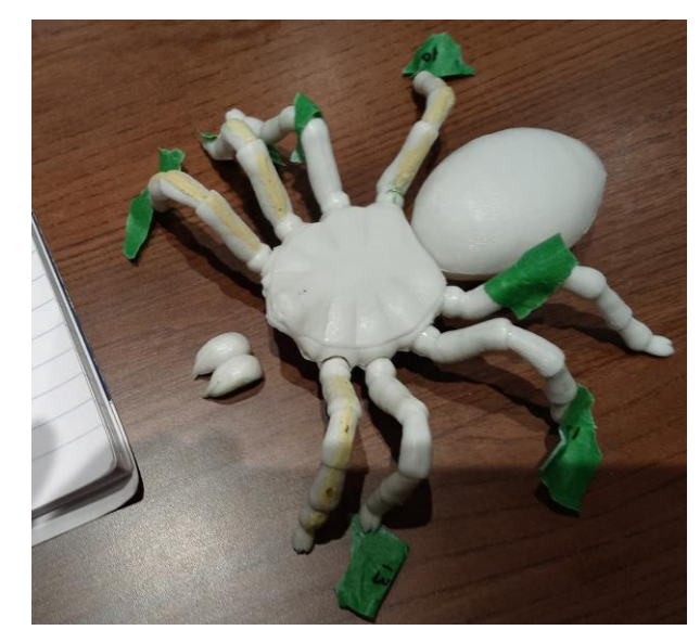
Mike Schwarze also provided a variety of table items, including BlackBeard and a Tarantula of menacing proportions...