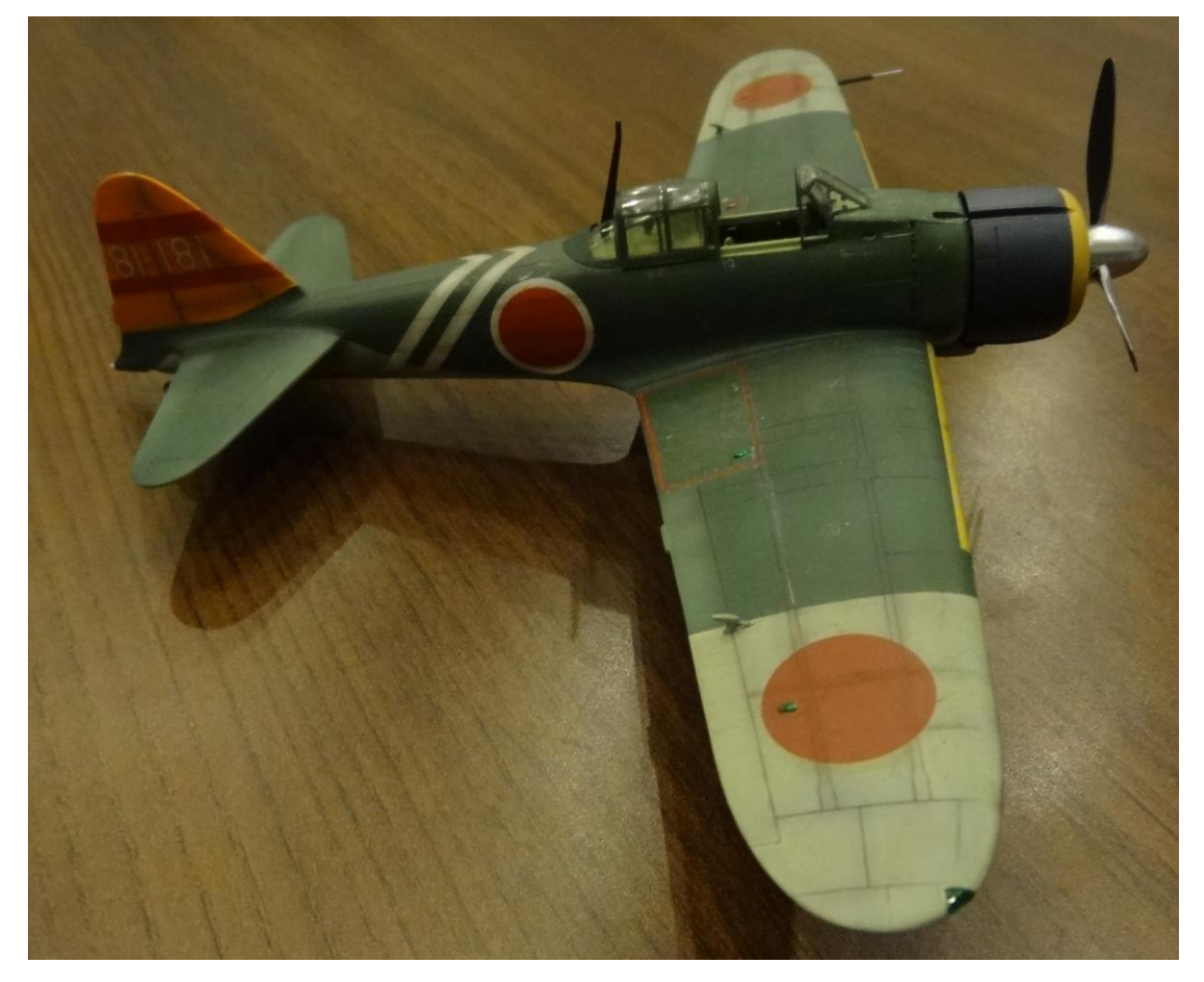
NOVEMBER "S.O.N.S " SECOND PLACE for "Orange Tail Zero "