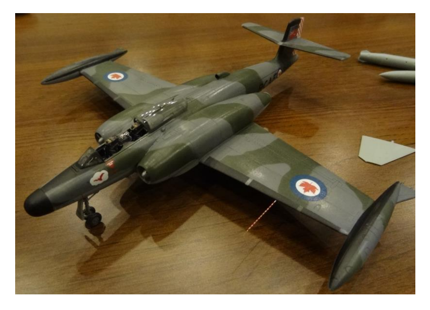
Chris Bucholtz 's Avro Canada CF-100 Canuck in 1/72<sup>nd</sup> scale done in NATO scheme, was "all Canadian, all the time" from base kit to decals. Unfortunately, the Editor didn't get all the Canadian details to relay to readers here...sorry.