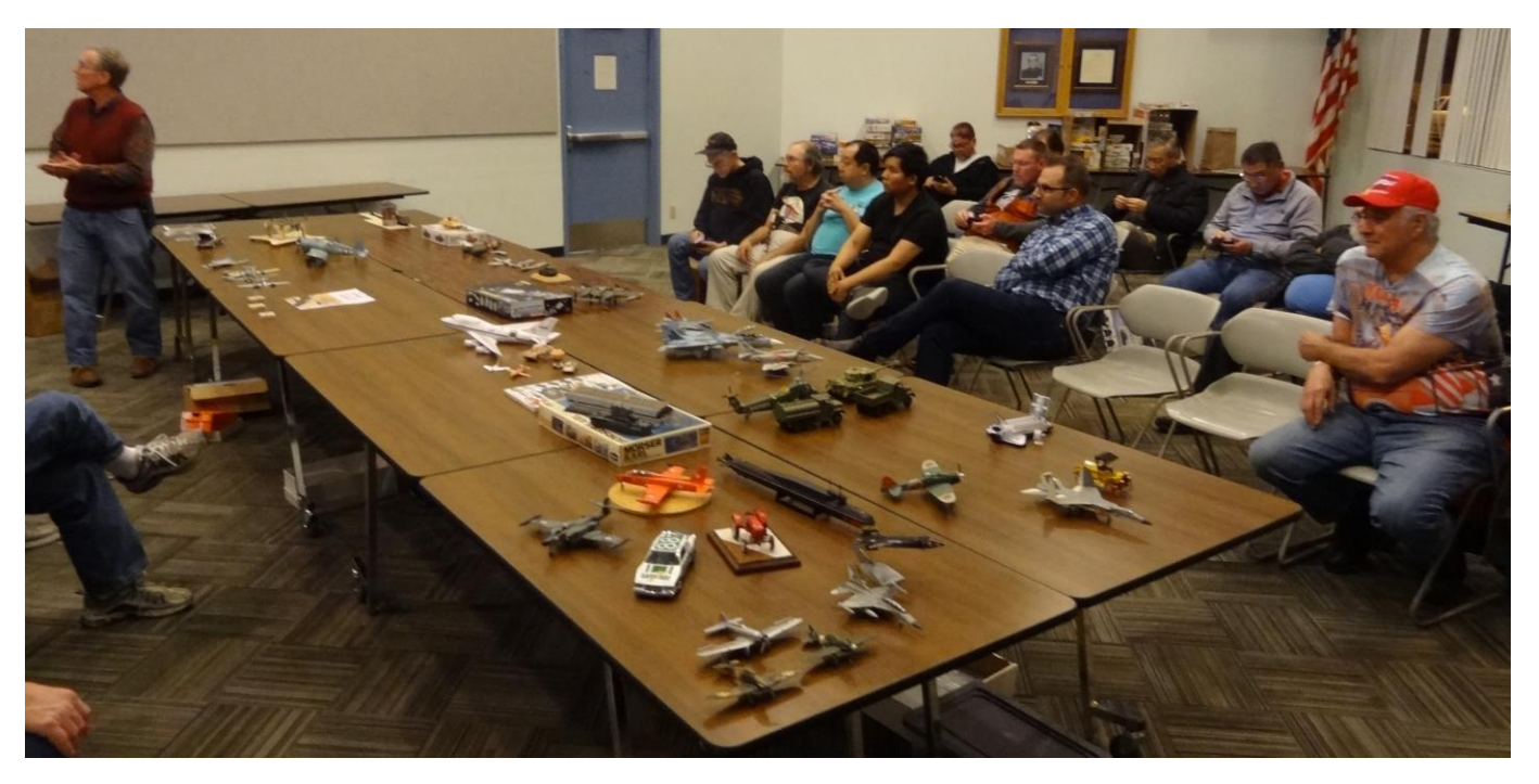
IN GRAND TRADITION, THE SPONSOR ENTERS OWN CLUB CONTEST WITH GUSTO !