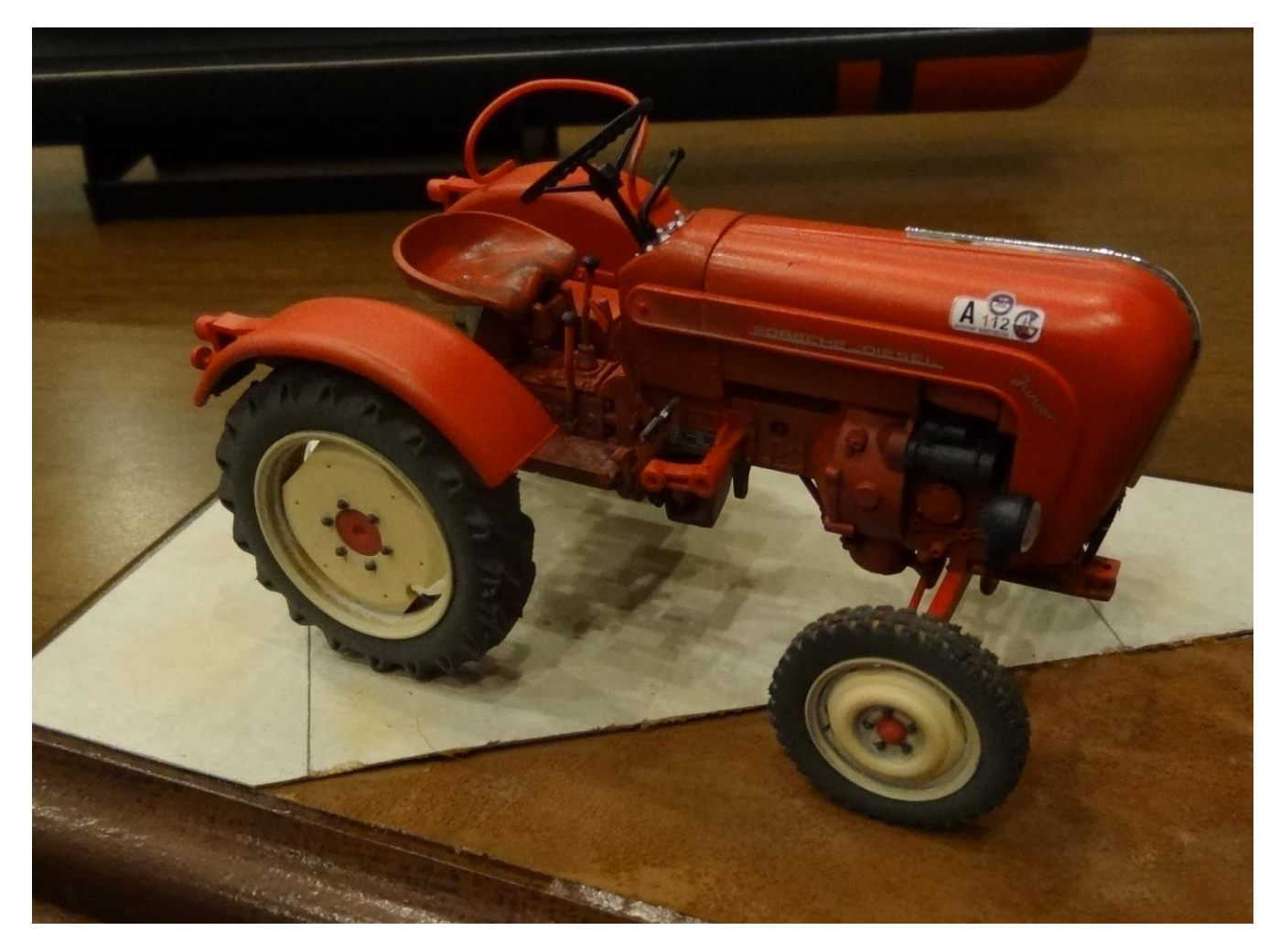
NOVEMBER "S.O.N.S " THIRD PLACE for "Porsche Tractor "