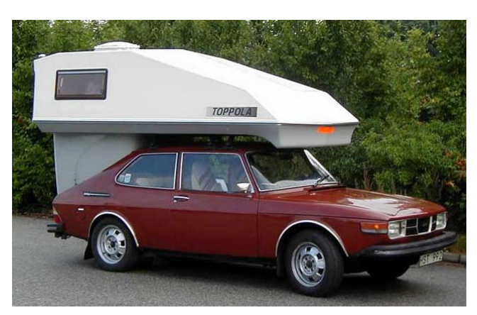
Here I found recent SAAB's Toppola camper conversion mod and their Saab 92H 2 stroke motor home from 1963, most intriguing!