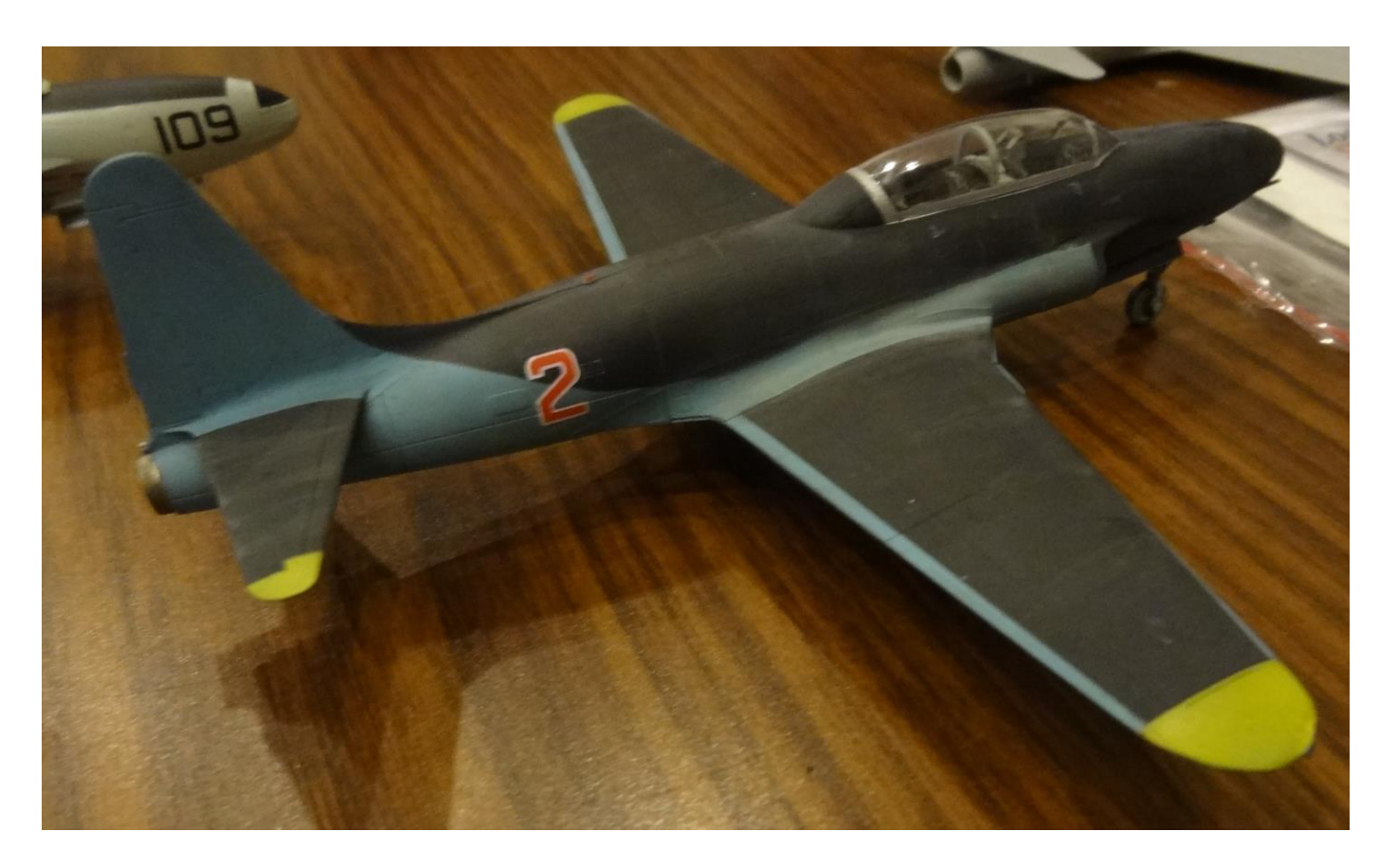
Bill Ferrante 's finished TV-2 was a build straight from the box except for some True Details ejection seats.