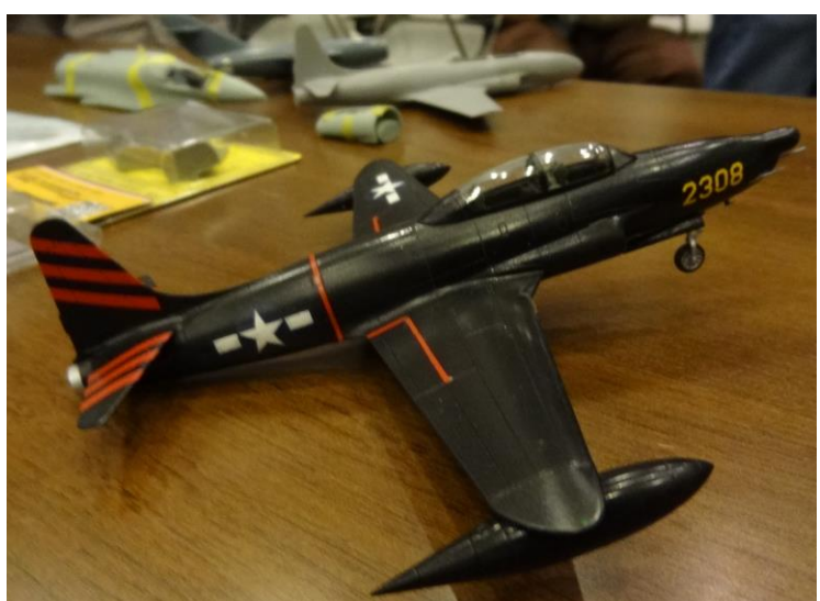
Greg's work in re-imagining the "T-Bird" here included revising wingtips to original rounded form, putting the large "ferry tanks" seen underwing on Korean War era F-80s, and an elegantly blended radar nose/cannon set.

We now begin properly in order. With meeting of AUGUST 2019, and Greg Plummer 's "phantom" Night Fighter Shooting Star, finished using the Platz T-33 kit as basis, thus hitting all the requirements of Bill's guidance here.