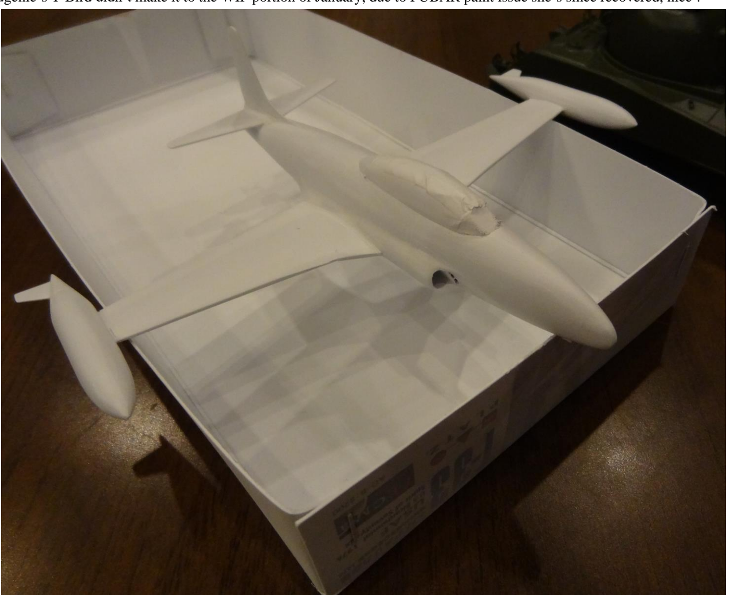
This time, I was able to put the shot I used in March OSS, into the size I think works more adequately, as seen above.