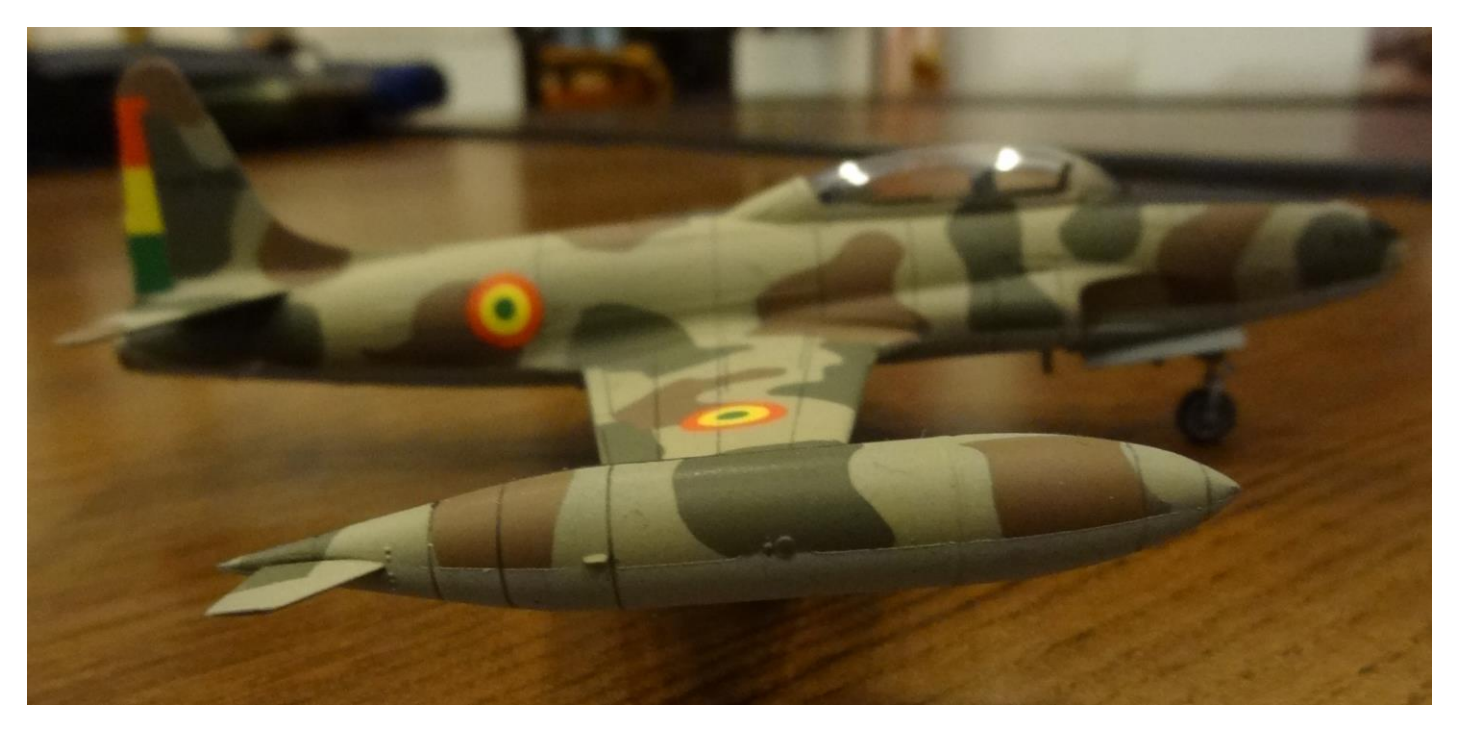
Jim Priete 's Bolivian AF Shooting Star took its own "great leap forward" in span between the January and February meets, you may recall from March OSS coverage. Here are a few additions to the single overhead view shot I put for illustrating in March issue, due to space constraints. I think you'll agree, this BAF T-Bird deserves more, better looks.