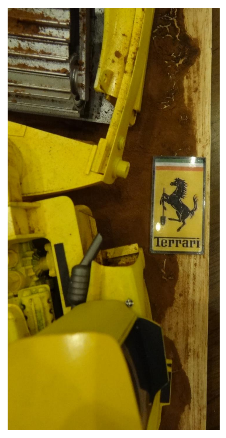
Thanks again for sharing your work, Greg! -mick fini

This time the crop is different, picture is larger and perhaps better overall in focus, detail.