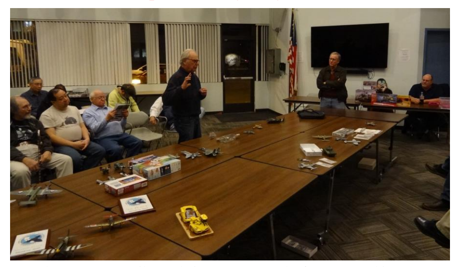
In above photos showing majority table items for January/February meets, eerily nearly in same spot, each of my essay subjects ...

We've all likely experienced this frustration over our modelling time, if we've been at it more than a few years. You get a subject kit out excitedly anticipating the project ahead, only to discover early on, or worse, whence well into it, there's items missing, This of course can often dampen enthusiasm or worse, kill your desire entirely to complete the model. Oh yes, you can find ways to order missing parts (if the manufacturer even still exists or has item inventory), or make substitutes, find someone who can, or painfully, rob another kit you have or obtain to supply material. Oh, sure .