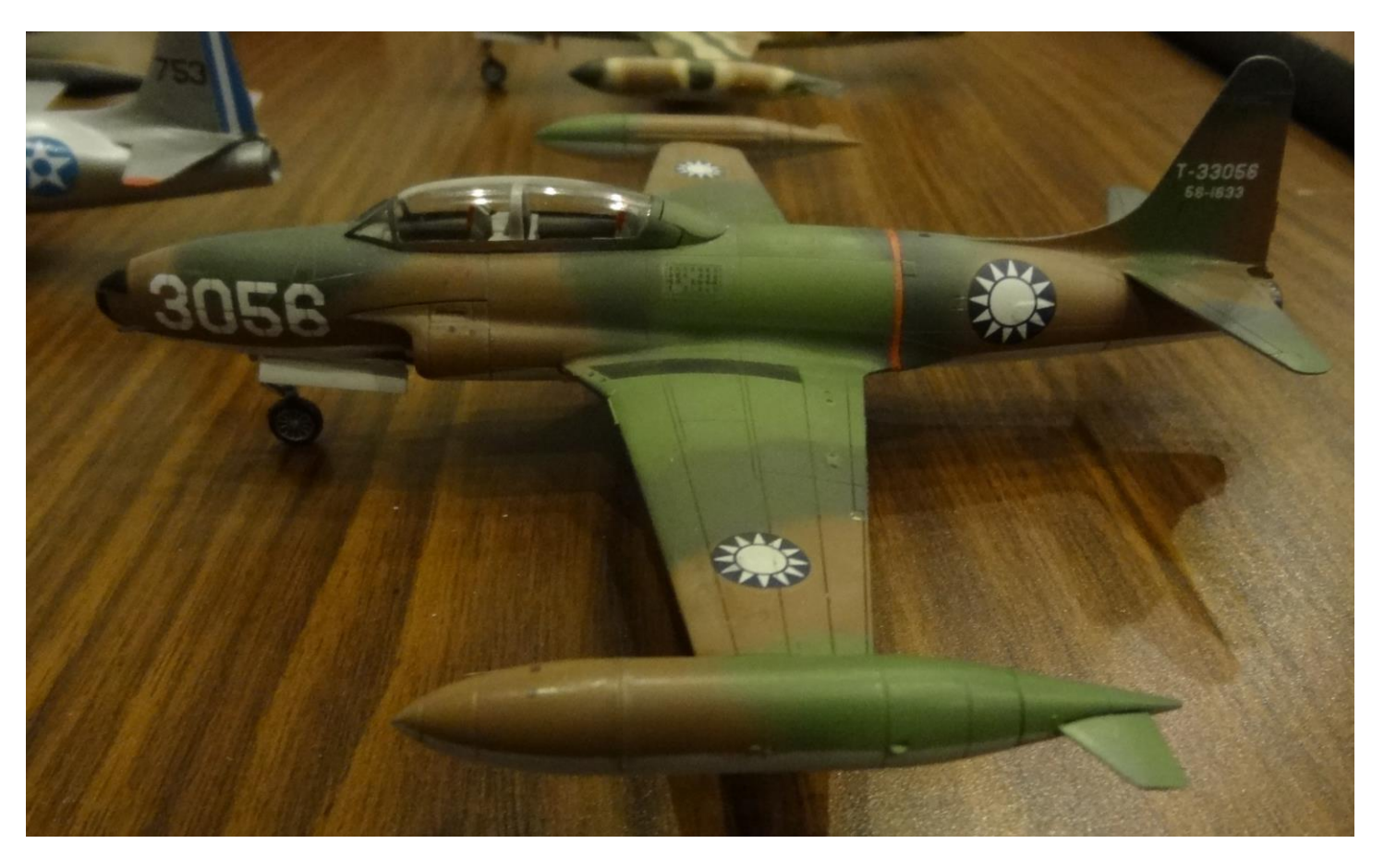
He chose camouflage and mixed his own paints! He also had a second T-33 on the table, a Guatemalan Shooting Star, but he built that one two years ago from the Hasegawa kit, which he re-scribed and dressed up with Microscale decals.