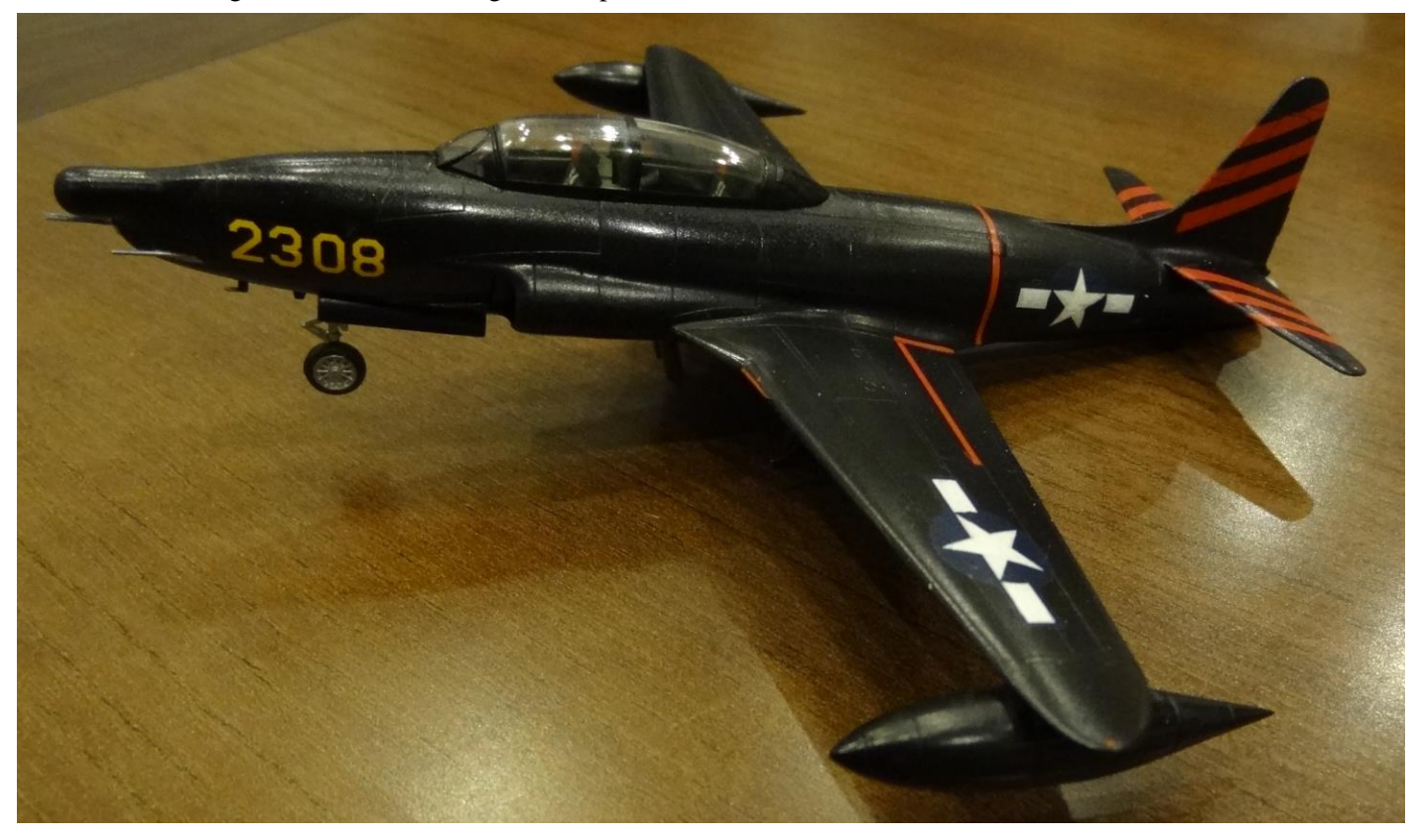
I am glad to now be able to show all my pics of his bird, which didn't show up to January meet. Maybe back for April? NOW – We surge forward, hurtle out of August 2019, through January opener to February 2020 and Kent McClure!

While the real P-80 Shooting Star single seat jet powered day fighter did in fact evolve into a two seat night fighter, the F-94 Starfire, itself coming from first evolution of P-80 into two seat trainer/day fighter (as in form of the T-33, which had also a "gunned" version), Greg's concept is not a close cousin of that.