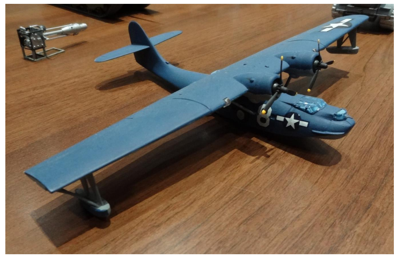
With great enthusiasm for the idea, Cliff took up the Atlantis Models Challenge Category for SV Classic # 7 coming now in 2022, as added reason to check the 1/104 scsle PBY-5A re release. He recalled building an original release of this Monogram molding back in 1955, the kit's birth year