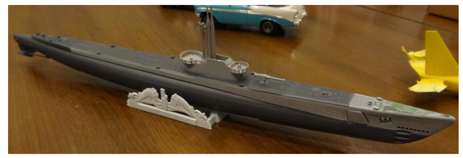
Yes, this is "Airliner Ken" underway with a small scale WW2 USN submersible. Looking forward 😂