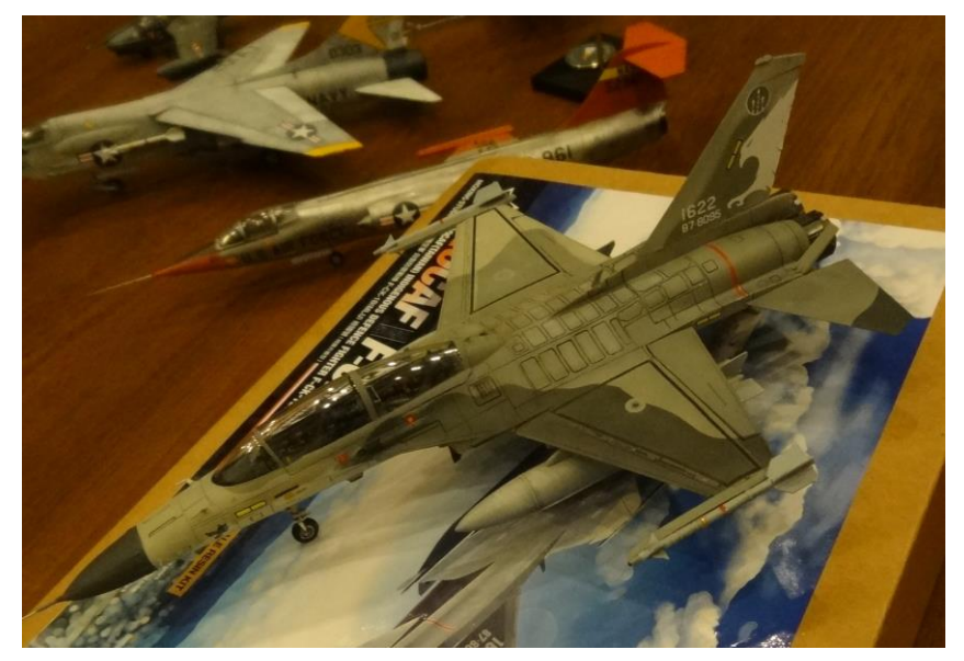
F-CK-1B MLU "Ching Kuo" - Moxing Studios resin kit

1/72<sup>nd</sup> scale Gemini Spacecraft – "Molly Brown", Jordan's most intriguing display of the night to this Editor! NOT A KIT , this model was created using CAD and then 3D printed on a resin SLA printer.