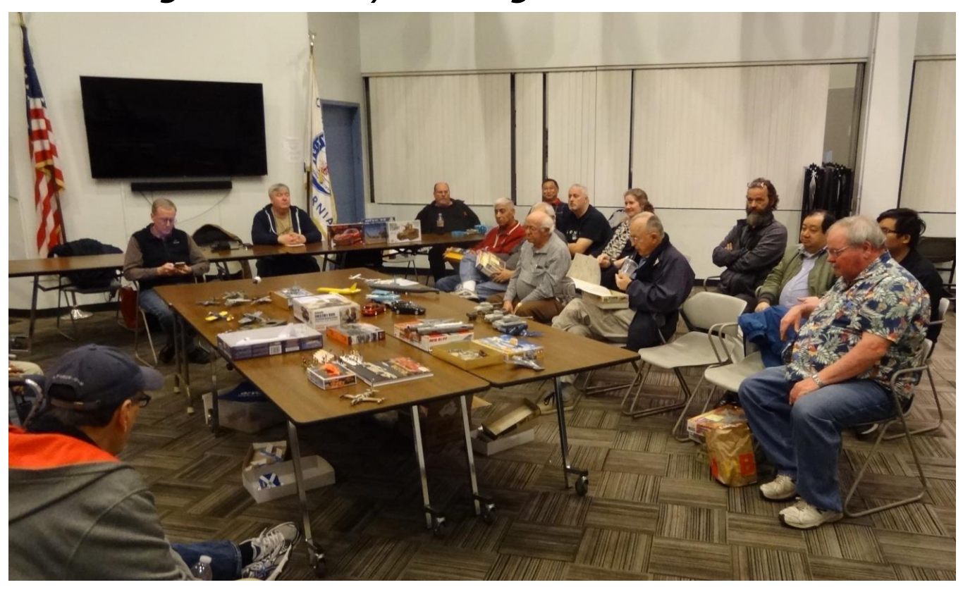
Even Without The Secretary, Editor Has Photos & Some News Minutes/Text: Mick Burton