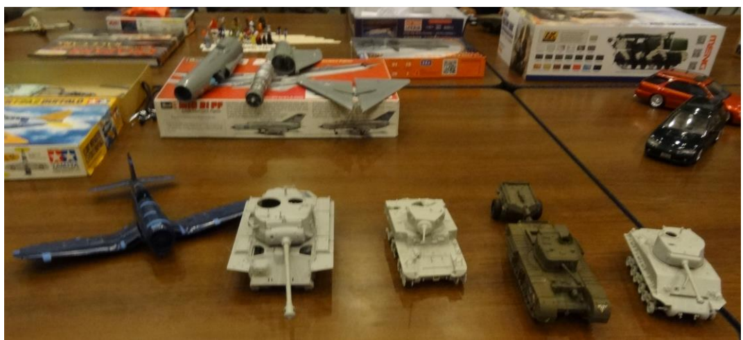
Let's see on page 3...