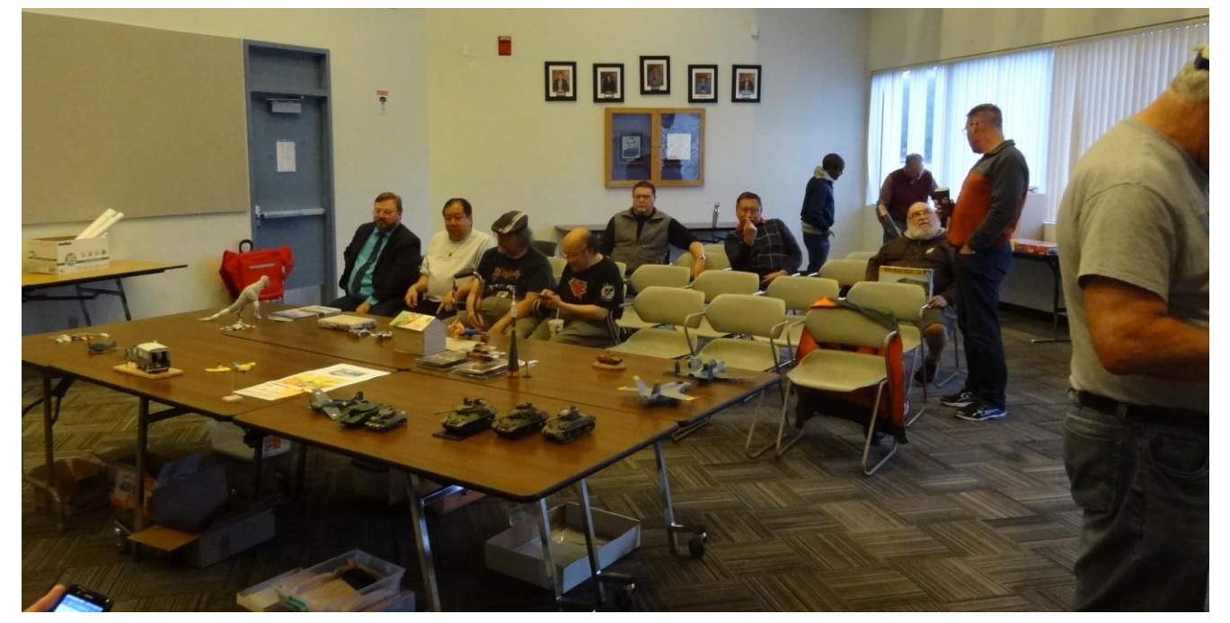
NO, not saying we won't meet. Just be sure to WEAR MASKS ALL TIME, STAY DISTANT...

No particular theme or important specific details. Just the true, relaxing, taking it easy way it has been for oh so many years. No reason to speculate or imagine that this MUST NOW CEASE.