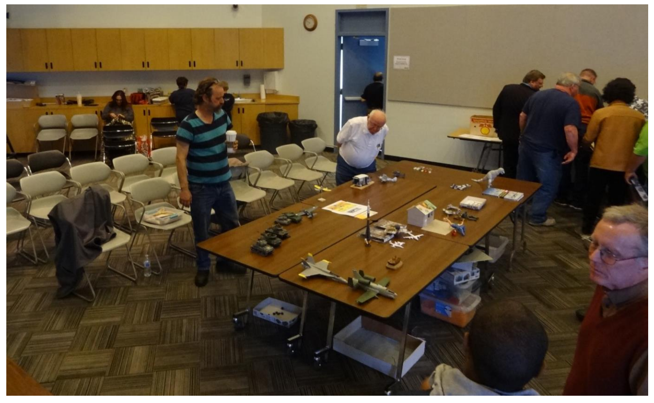
Every Now and Then A BIG MEETING ATTEND Without Account... Minutes/Text: Chris Bucholtz/Mick Burton