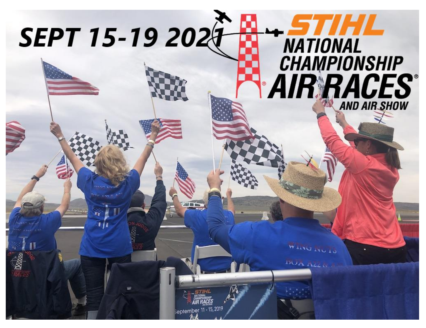
(note this is an unofficial flyer, created by MIRANDCO)

Alas, this apparently will be only returning veteran of the shows we know & love in September from Nevada. The Reno High Rollers won't be putting on one in 2021, sadly their long running classic is to remain on hiatus. But next year...?