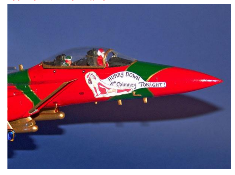
My girl sent these in loving support of a passionate obsession of mine I try to call a "hobby" and a hope that year ahead provides full scale fun