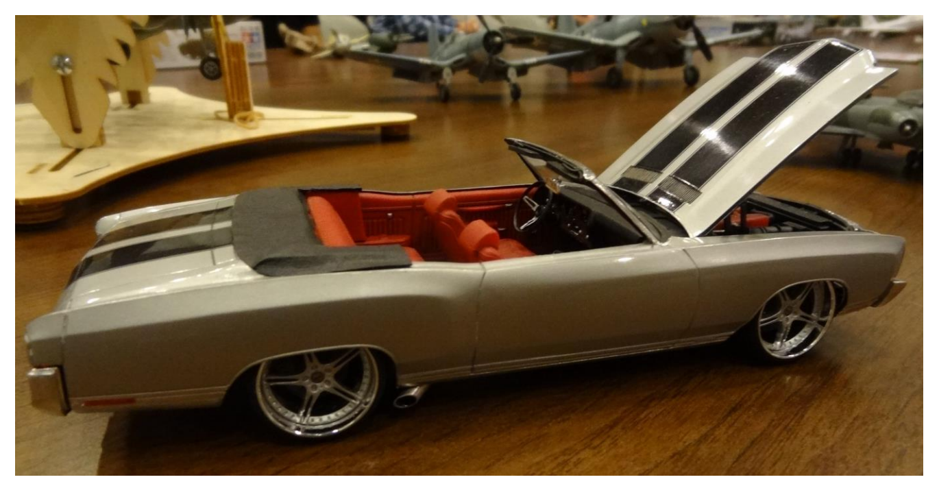
An interesting automobile offering from Greg Plummer, I believe.