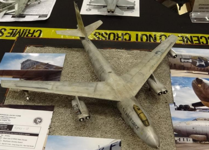
The B-47 I am sure, probably would be a hit with more than a small percentage of you reading this, but my fascination with the waste container not so.