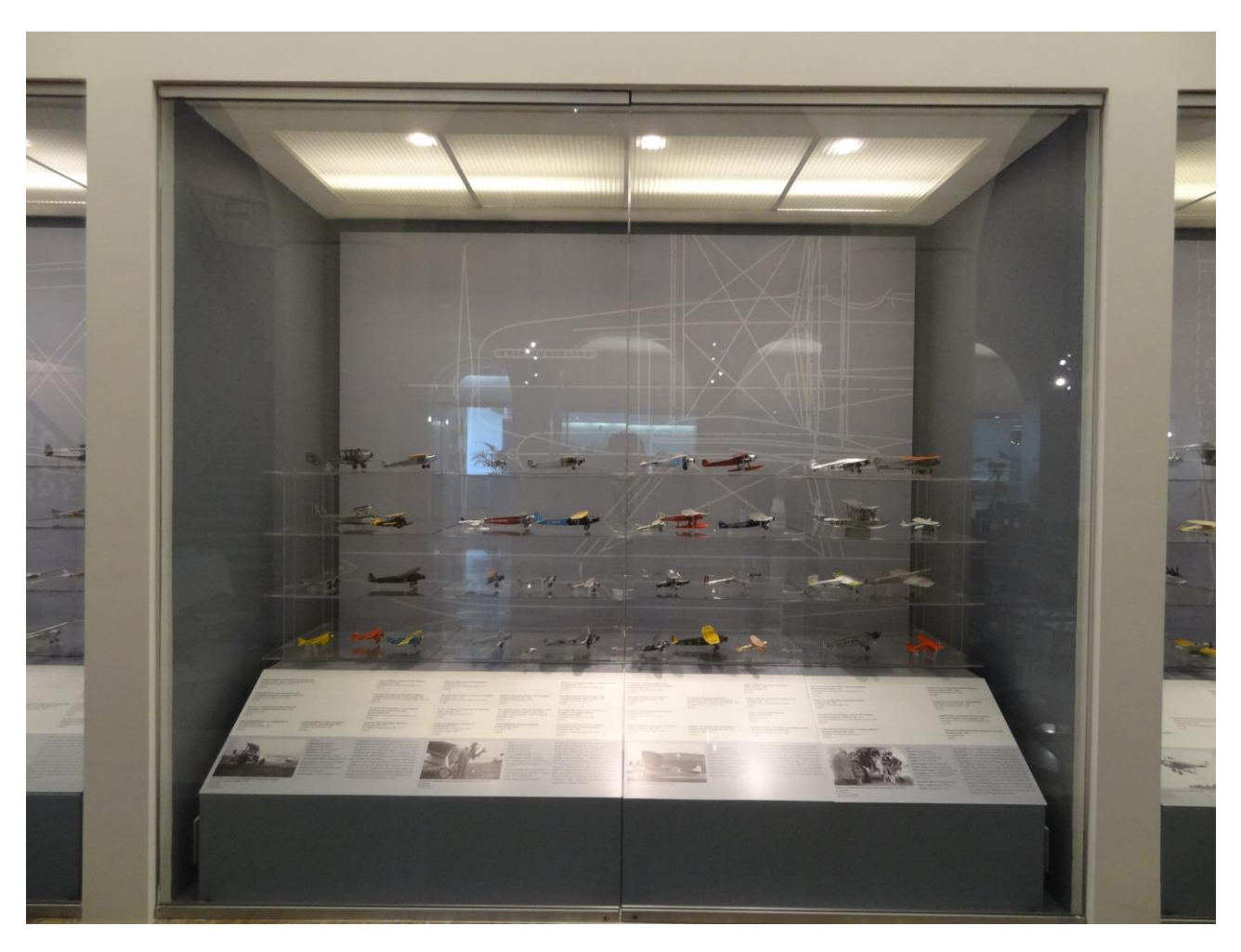
A closing look wrapup with one of Prewar Cases and a tribute to Jim's photography