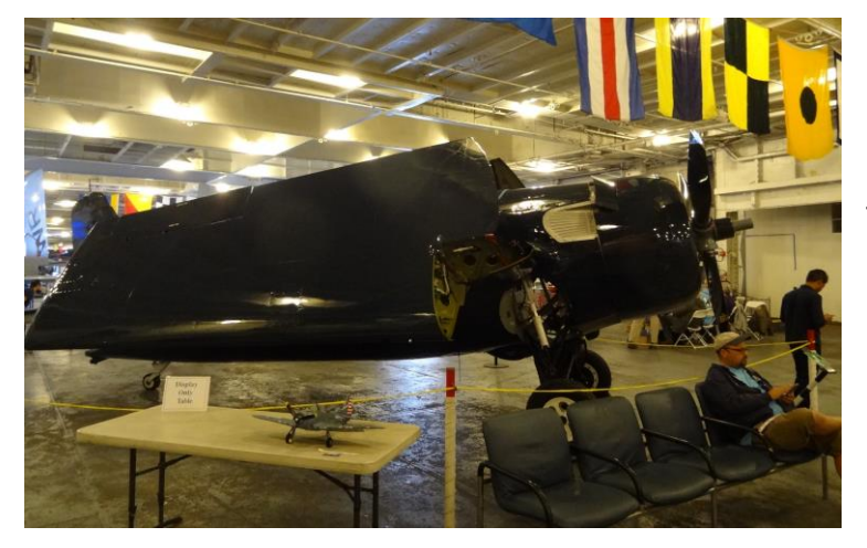
A Few More Looks at Model Expo 10-14-17 Photos/Text: Mick Burton Models: By Many Others, not him