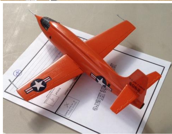
OKAY it has been another busy month now onto November which reminds me, keep smiling and MOVE OUT - mickb