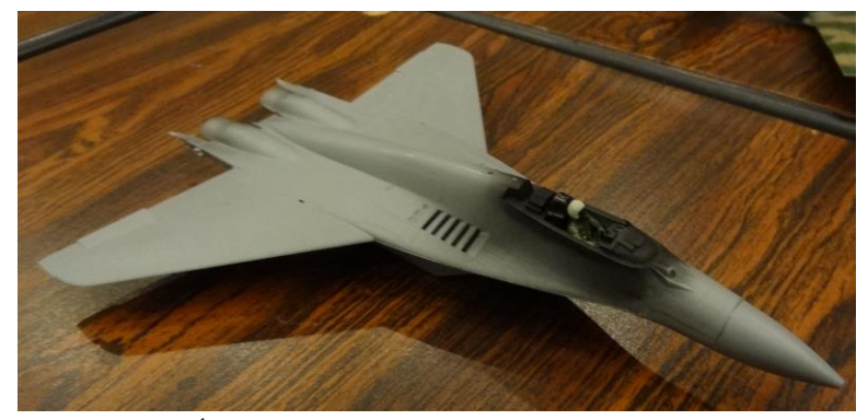
1/72<sup>nd</sup> MiG-29 "Fulcrum" now WIP as well, by Gabriel