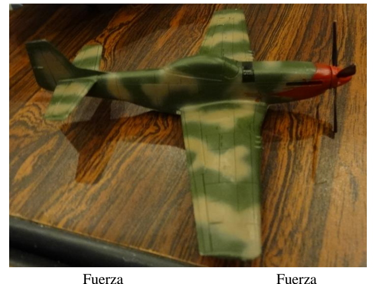
Fuerza Aerea Uruguay