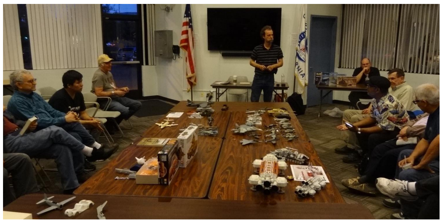
A Club Contest in Form of Election is Made Memorable by Grand Mislead by the Mistakenly Re-elected Editor (from 1)

Yes, first paragraph of course, as anyone who carefully read the April TAMS, is just a bit of belated foolishness.