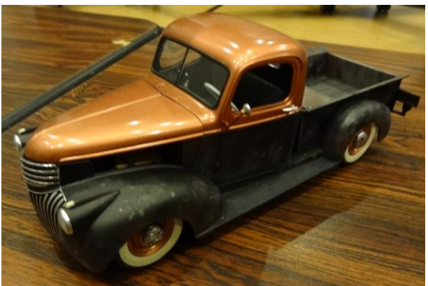
Next up, Greg Plummer reviewed his four winning entries from SVC # 3 as seen here