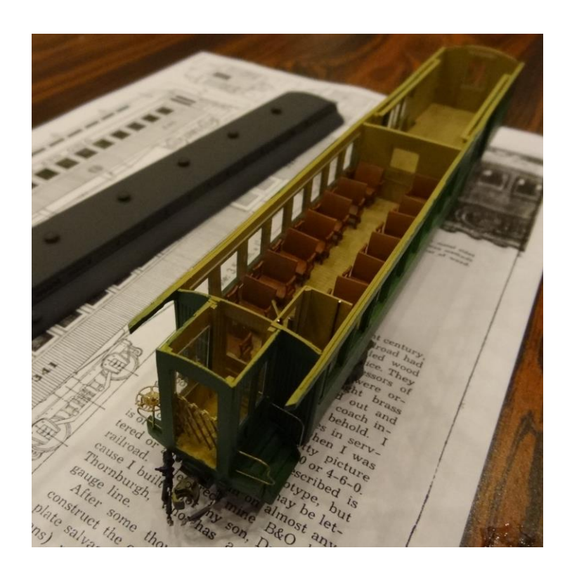
John Carr's latest completed bust, sorry no details recorded... but you can see it's a nice art work!