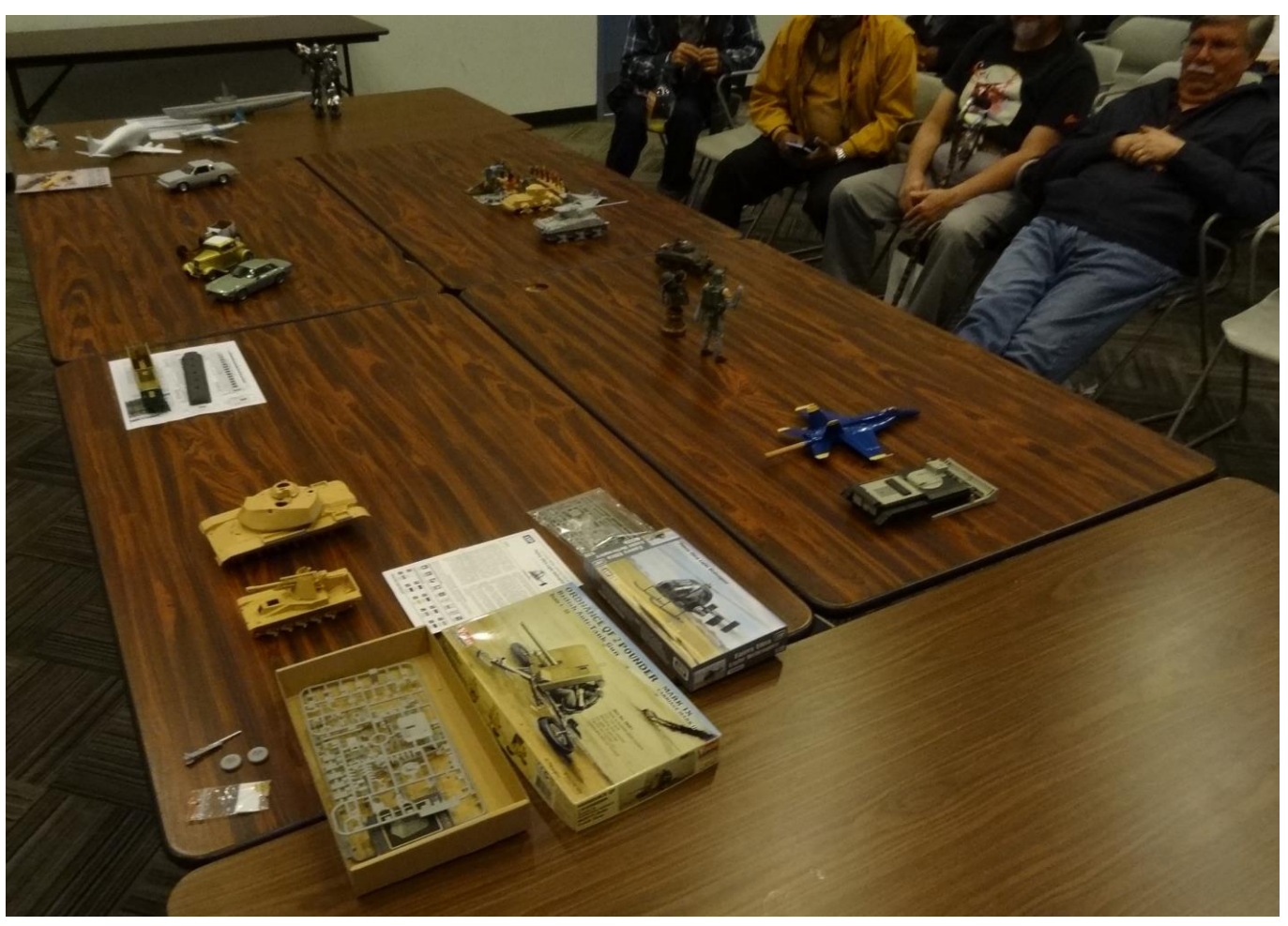
Editor Reviews Scantily Again, February SVSM Meet Due He Took No Notes or Notice, Only Photos... (from page 1)

At the opening of February SVSM Friday meeting night, the Editor arrived Just In Time, after having sent out the February OSS e-publication just a couple of hours earlier. This, after finally having a truly publishable Fremont Hornets Buzz just ahead of it, only week past meet that that item was to herald.