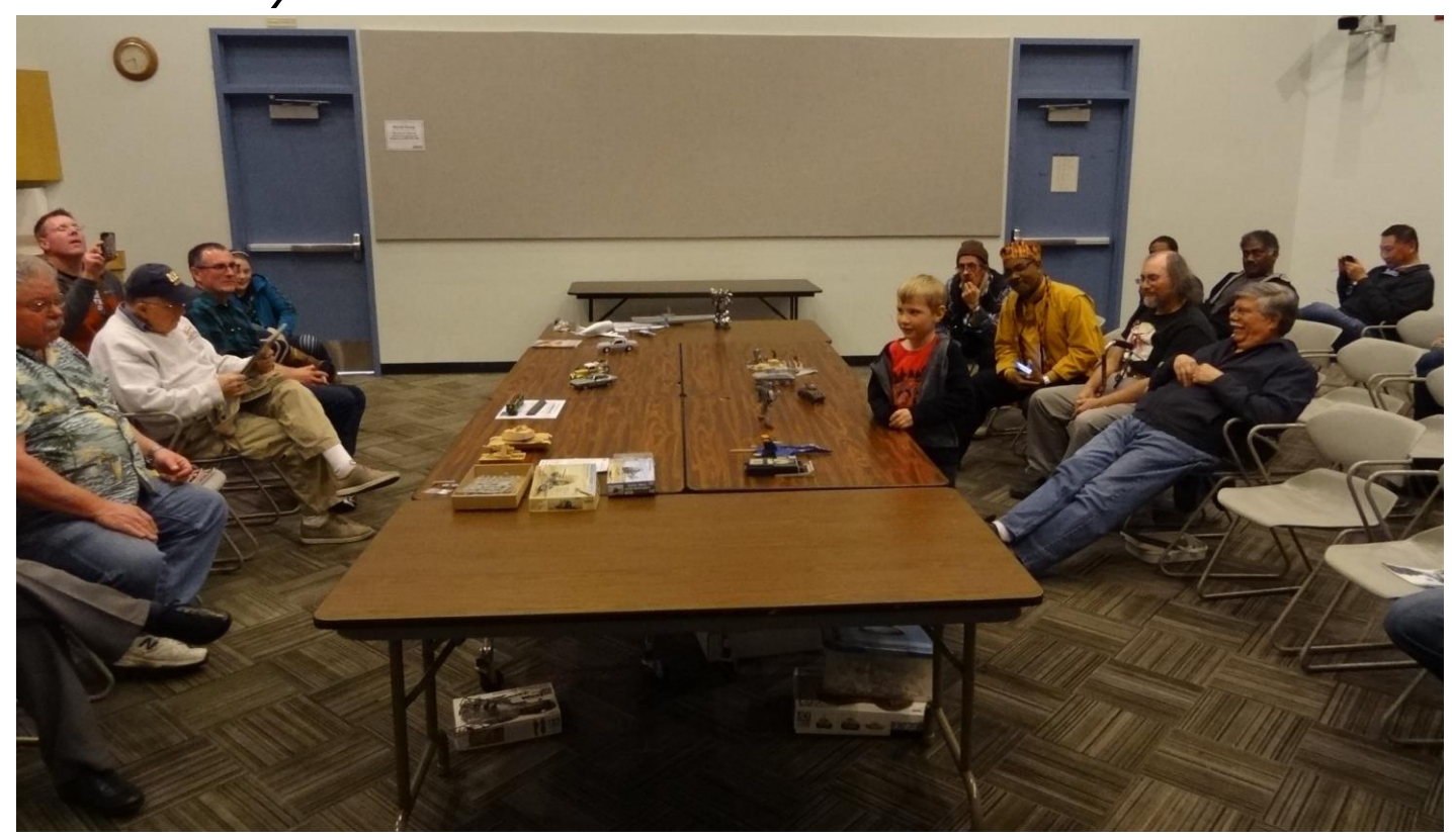
AS OPPOSED TO MIGHTY SMALL