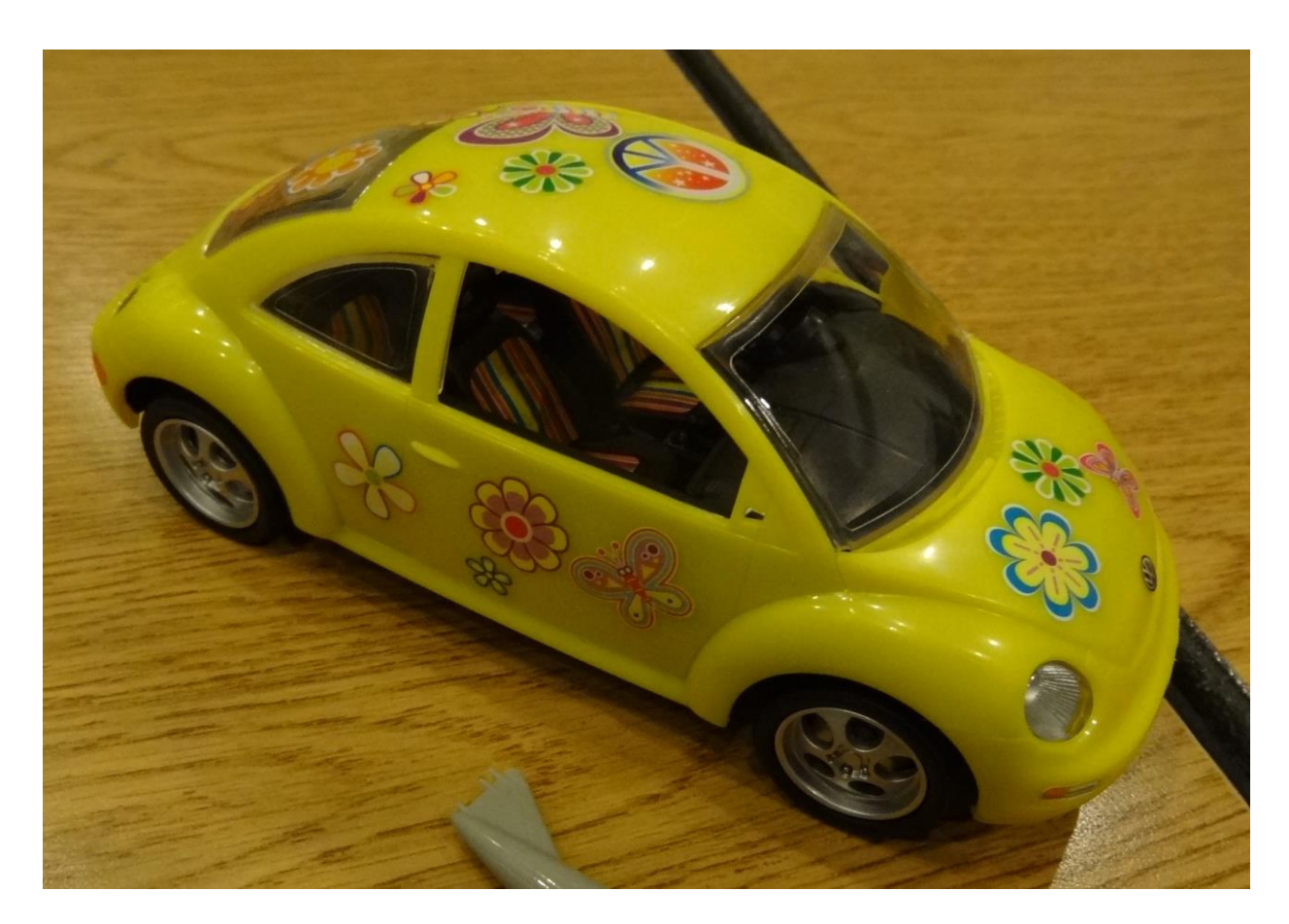
Congratulations to Amelia Bucholtz FOR WINNING MAY MODEL OF THE MONTH ( Two of Two )