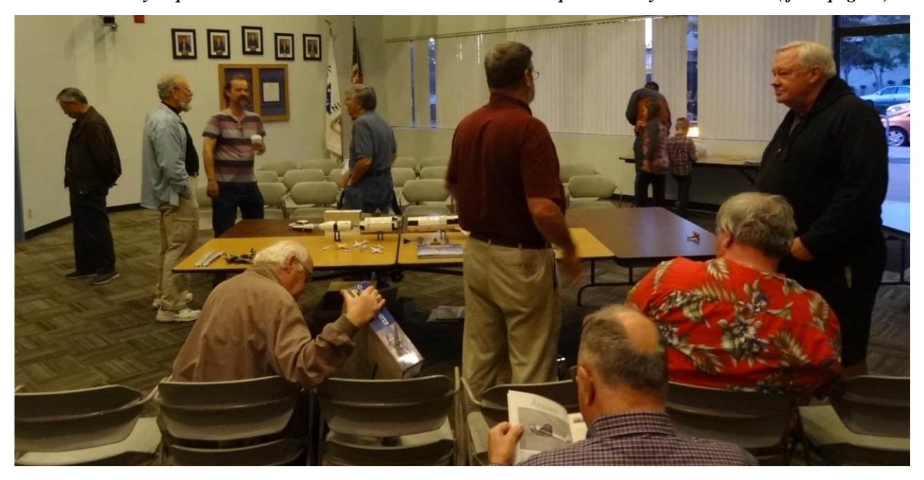
Editor Randomly Reprises Moments and Members Seen Gathered In April and May 2018 Meets ... (from page 1)