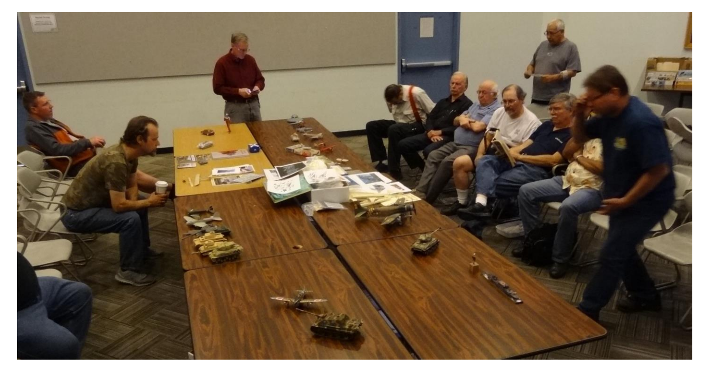
A Club Meeting Recorded Now as Our Usual Suspects Intended, As Rendered by Mistakenly Re-elected Editor (from 1)

At the May meeting, we leaped right into Model Talk.