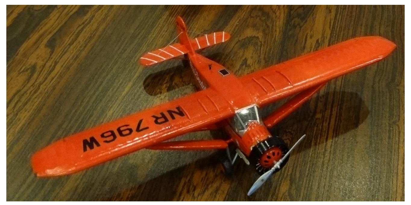
He extended the wingtips and made other modifications to create "Miss Veedol," the first plane to fly across the Pacific, and only then sourced the decals from another history buff who expanded Jim's collection of photos of the plane by more than 100 images!