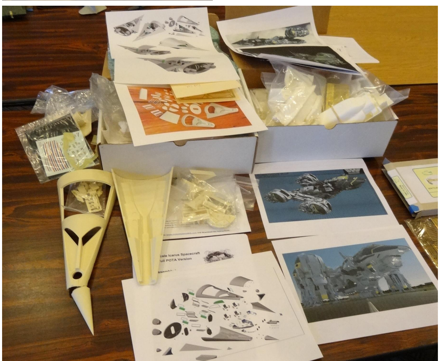
Crow's Nest kit of the Icarus from the original Planet of the Apes , (above, right) which comes with ready-to-wire clear consoles, figures that are both in sleeping and awake positions and a lot of photoetched detail.