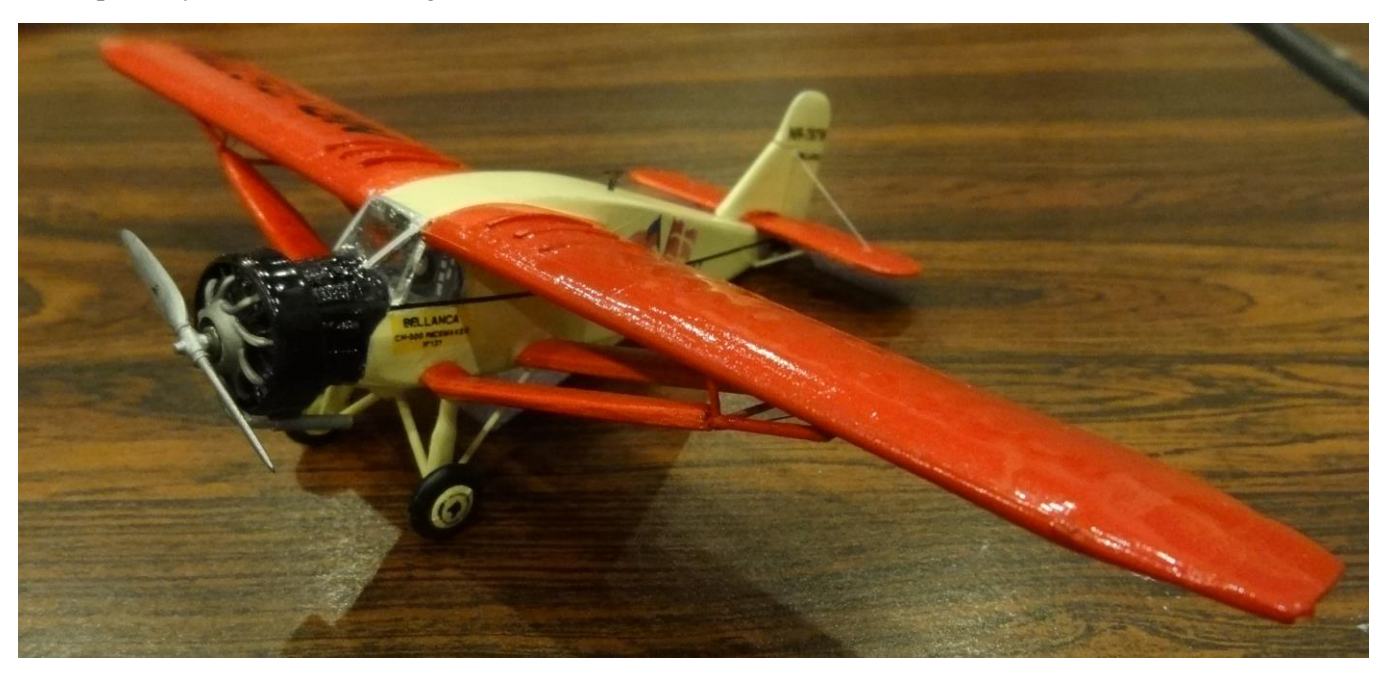
He also modified and finished a second Bellanca to represent "Miss Liberty," which made a record-setting flight from New York to Copenhagen.