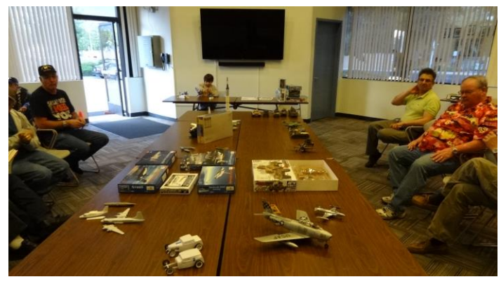
fact, somewhat true. Just look at that pile! (Continued on 3)

Scant Structured NON MINUTES for SVSM MAY Meet