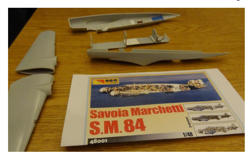
An obscure Italian in 1/48 in WIP, and a WIP Zero-sen on right ...

This Cadillac Gage V-100 is a rather lesser known American Armored car success story for one. Apparently now a quality 1/35<sup>th</sup> injected styrene kit now available as seen here.