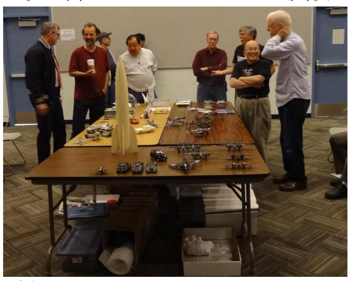
At the June meeting, above is a shot taken prior to business meeting being opened. As it turned out, a lack of personnel to take knowledgeable notes (and some were taken, just lost later by Editor...) means at this late publishing point, newsletter will be a "views letter". A sampling of June's assemblage: