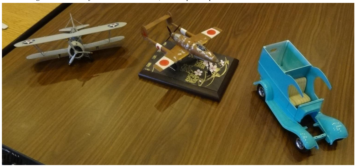
Greg Plummer is not just the SVSM President, he's the prolific producer of these three varied wonders here!

Biplane is an Accurate Miniatures F3F-2 in Neutrality Gray vs the "circus wagon schema" San Diego Air Base markings, 1/48 scale. In middle, a 1/72 Ki-98, from Meng kit, done in a hypothetical Pacific 1946 scheme, real one was actually an unfinished prototype found in China at World War Two's end. Third one has some story!