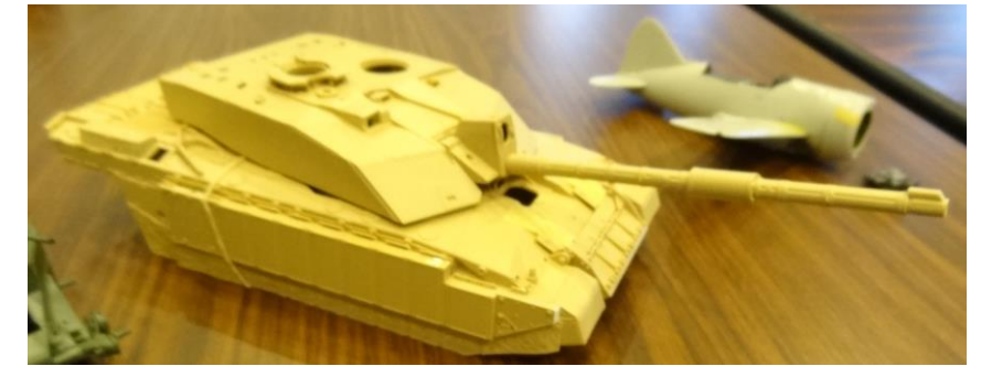
Laramie Wright had a Quad Squad of WIP. Start with grey 1/35 Stug C, green BT-7, sand shade Challenger 2 all by Tamiya. As is the 1/48 Brewster Buffalo to be done as FENF (Dutch). An

older kit, which he's improving with research for wheel well detail