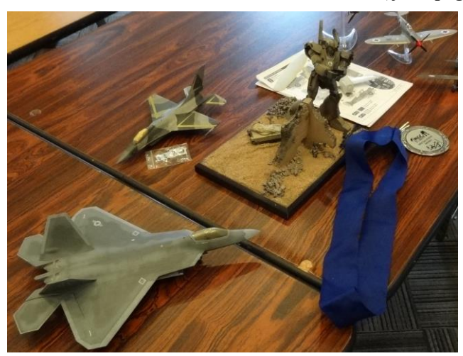
FINAL MOMENTS FOR JUNE MEET (from page 8) (Go To Page 3 if you haven't picked up from Page 1 story...)