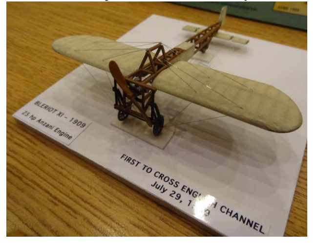
Speaking of fiendish plays on the Editor's mind, as

all would take up model aircraft as hobby in this niche. Much appreciation for the extremely well rendered and