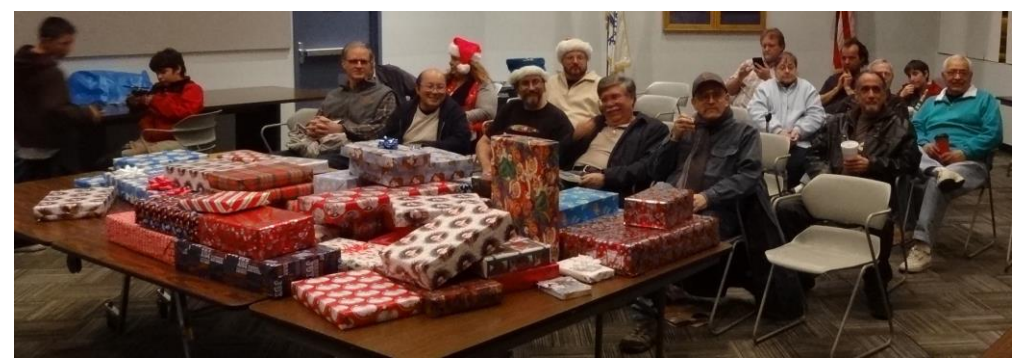
NOTE The DECEMBER GIFT EXCHANGE is the sole business Agenda item for meeting! NO MODEL TALK Locale: Our Standard Meeting Place, Milpitas PD Community Room, from 8-1030pm. OFFICIAL RULES BELOW: