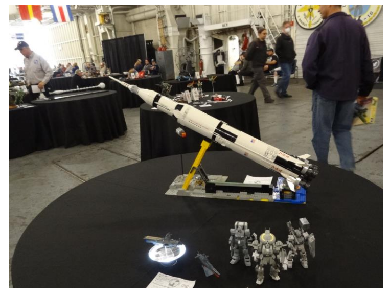
And then NOVEMBER SAW THIS SUCCESS STORY, THANKS TO IPMS Gray Ghost club created for it!