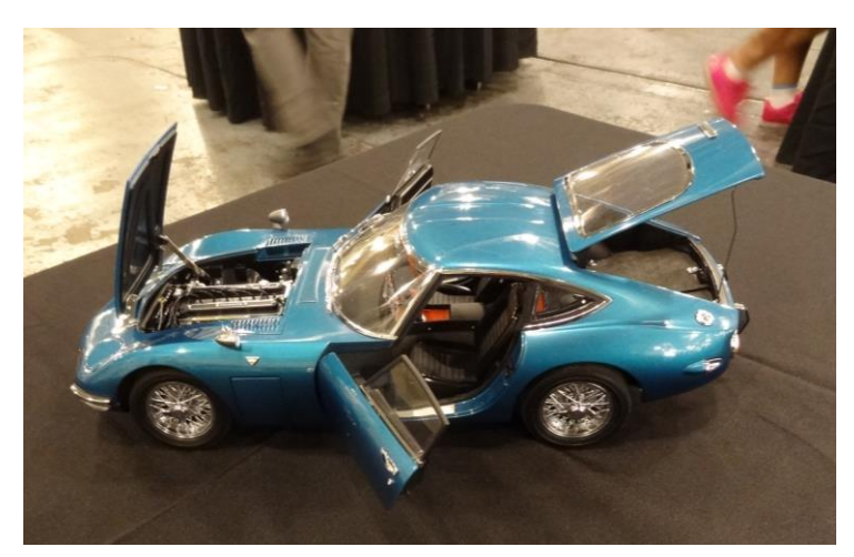
YES again in the fall we find ourselves aboard the USS Hornet Museum Ship, for a superb showing of Modelling Community.