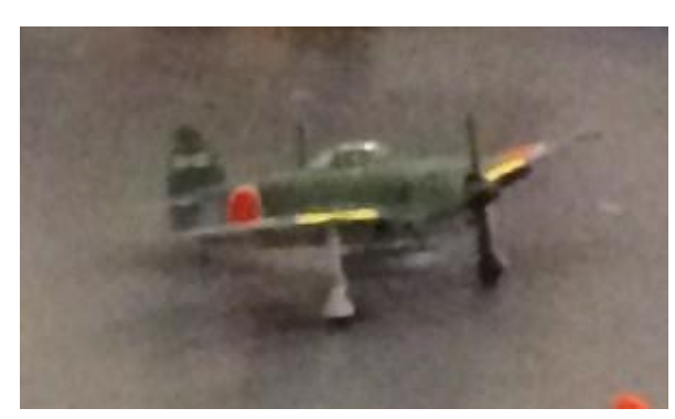
Then a 1/48<sup>th</sup> Kawanishi N1K "George" fighter from World War Two Imperial Japanese Naval Air Forces, by Honored Shipwright