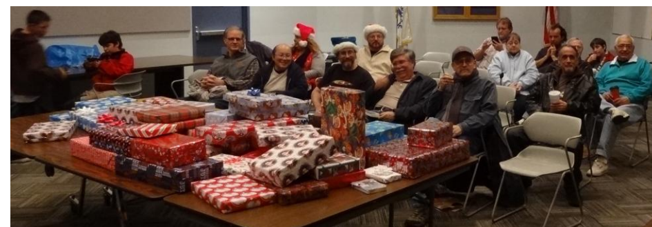
NOTE The DECEMBER GIFT EXCHANGE is the sole business Agenda item for meeting! NO MODEL TALK