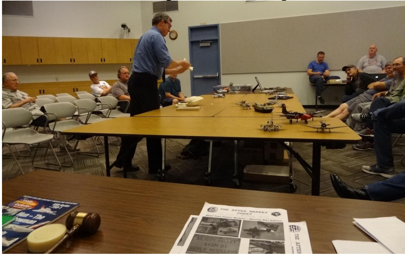
EDITOR Horrified at Rude Horseplay With Prehistoric Resin Remains