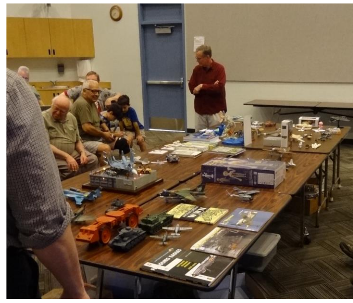
Editor Reviews a Few Highlights of July's "Explosion of Populace" (To Intro New Faces & Welcome Back Old @)