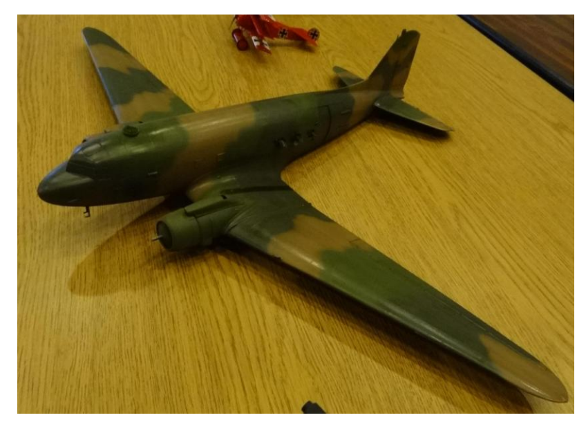
Thanh Nguyen has been very busy with this big bird, of course it's SEA camo'd which Thanh is a clear expert in. The Monogram 1/48<sup>th</sup> twin, is a Vietnam War USAF AC-47 with those triple 7.62mm mini-guns ready to render peace...