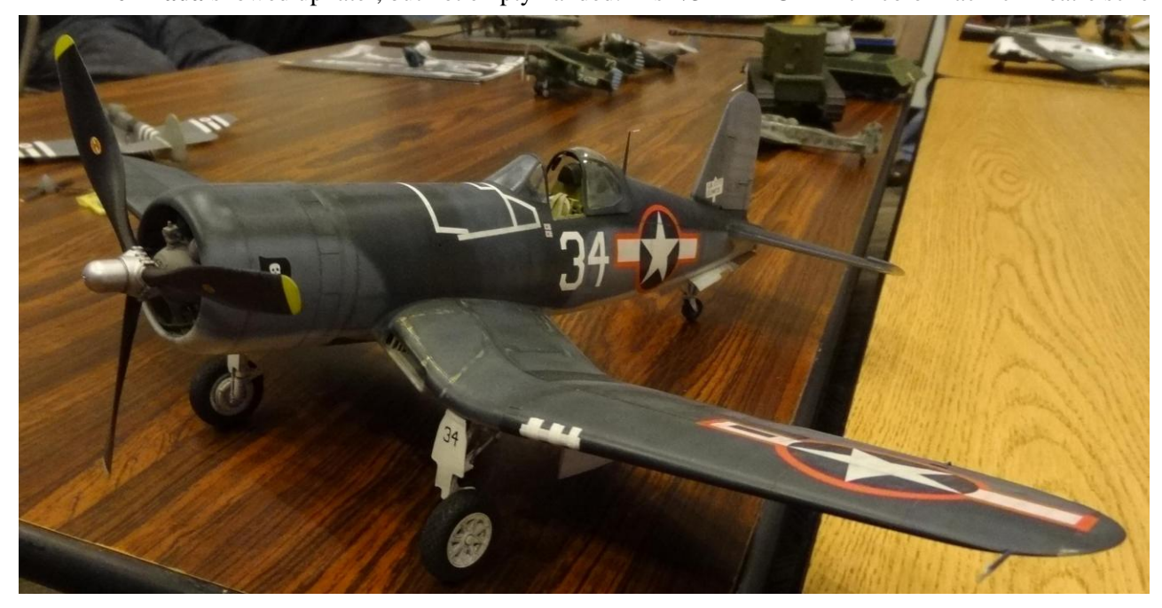
Ben Pada showed up later, but not empty handed. His 1/32<sup>nd</sup> F4U-1 in tri-color Pacific Theatre scheme, grand.