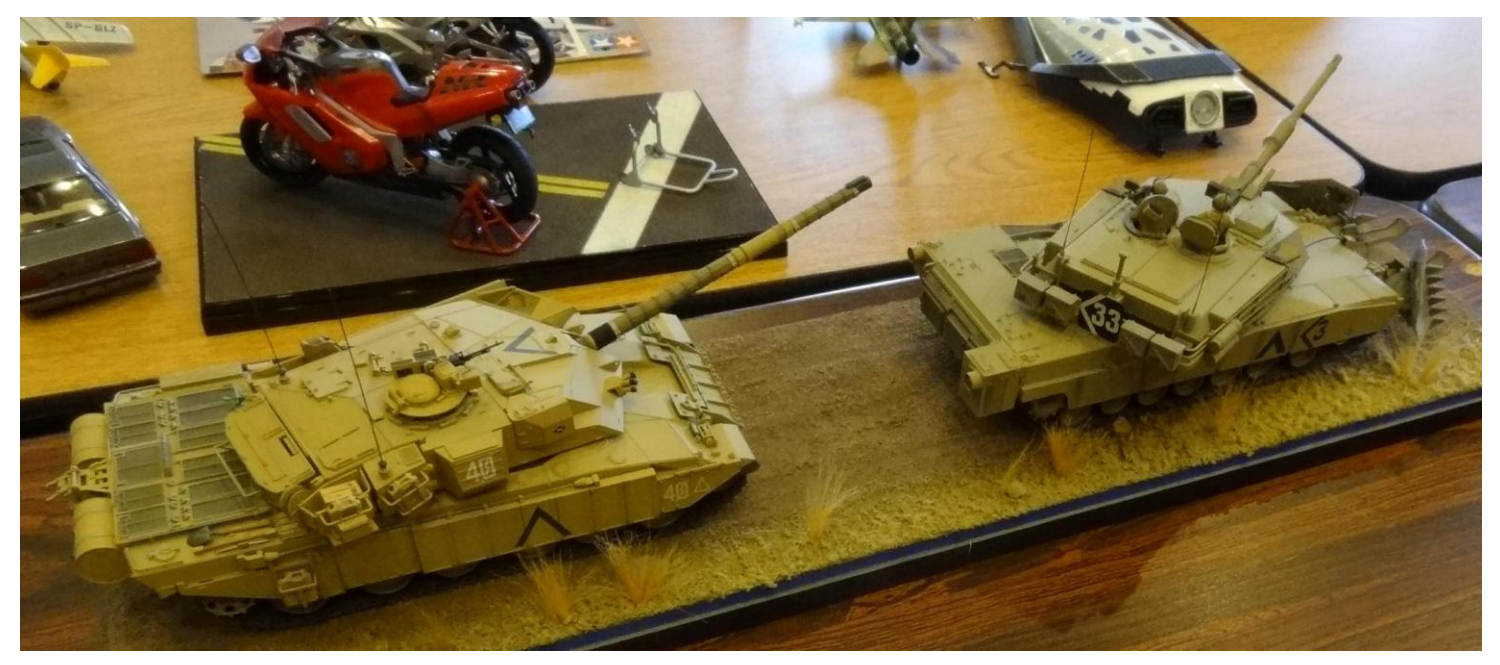
Temo C , having brought a raft of aircraft last month to introduce himself, this meeting shared two excellent 1/35<sup>th</sup> USA modern armor vehicles. Plus a pair of large scale modern super bikes. Glad he's chosen us? Sure!