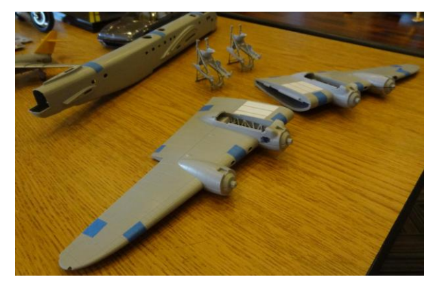
of Short Stirling heavy bomber, which til now was only available if you tackled the 1960s vintage Airfix kit. Jim still found a number of ways to "improve" detailing, but he points out that's a stock cockpit.