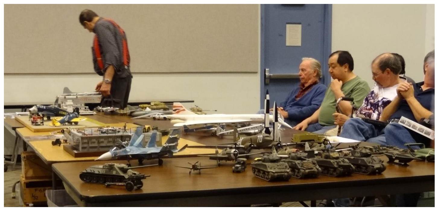
A Club Contest Memorable and a Grand Replica of a Local Landmark Enhance Our Third 2017 Meet (from 1)