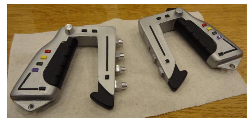
On the left, again a clever, well done model of not so well recorded origin. Lastly below, "Star Wars" feats.