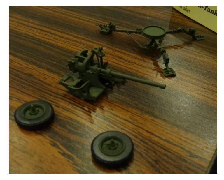
And the model of the month went to...

Randy Ray's Vulcan 2-pounder gun is painted and ready to be assembled. He was frustrated that the reinforcing bands on the carriage were depicted as square when the real ones were rounded – he replaced them with lead wire.