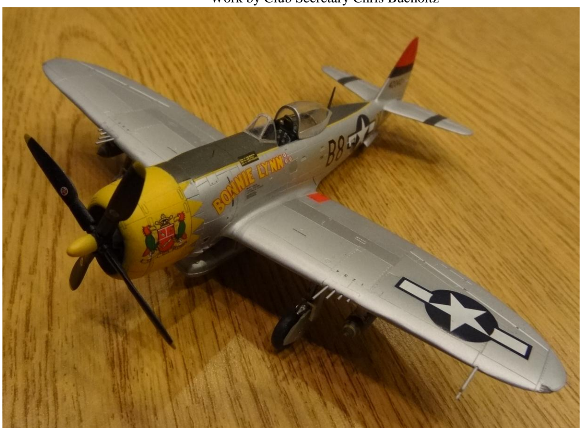
A Quick look back at the Editor's Club Contest February, covered in depth already in Feb AfterMarket Sheet