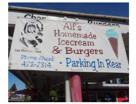
I'd tried to get some idea who to call, to report all of these nefarious goings on.

Sadly, as you see, the dude I saw was locked up with his own set of problems.