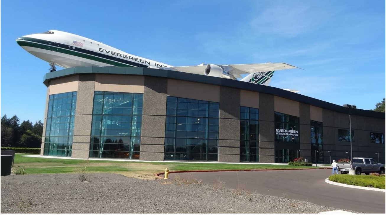
asking 37 bucks to go in as a "slider" or more evil, <u>12 dollars to merely stand around inside</u> as a spectator, I'd been thwarted in my quest for detective glory to prove otherwise, being a CHEAP MODELER TYPE that I am.