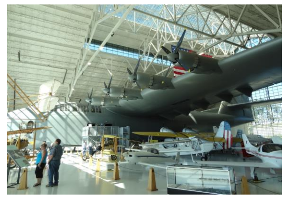
Seems to be a segue point for showing a look from inside current house of HK-1.

Where you see the Grumman, was part of the area this OHMS show once held.