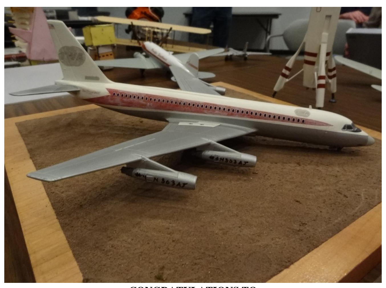
CONGRATULATIONS TO Ken Miller FOR WINNING OCTOBER MODEL OF THE MONTH