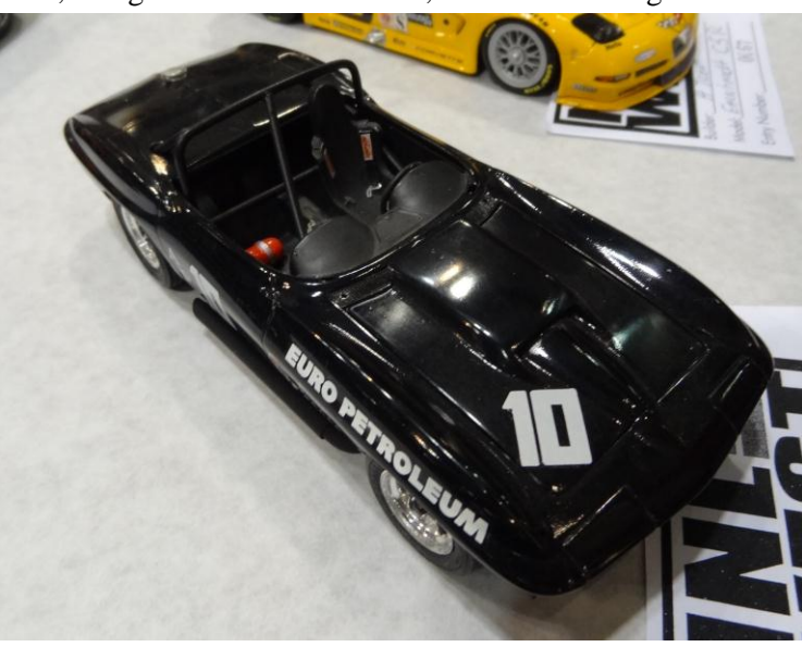
Following the best ever attended Hobby Expo 2013 in Petaluma put on a week before, was truly major uplift in the mood for starting year in the view of this member of our social modeling community. Don't think I'm alone.