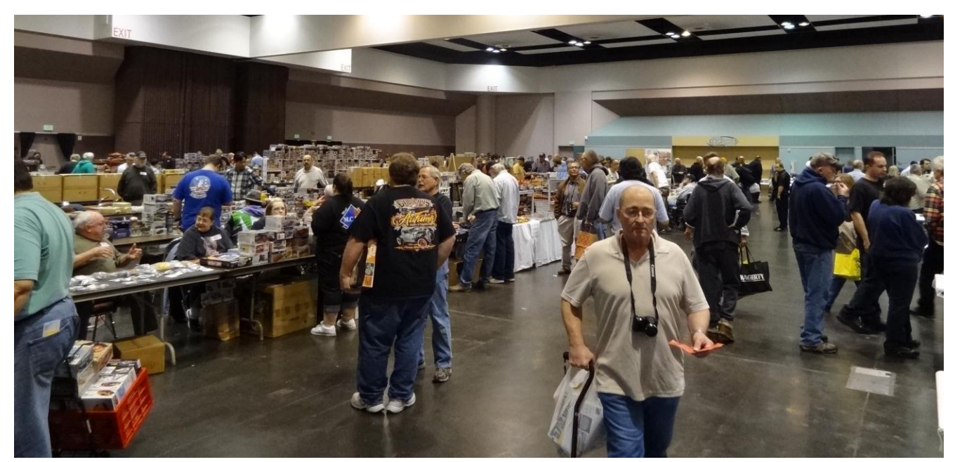
Tremendous response and a lot of fun to be had at NNL West 2013 Show (Ably assisted with a great shopping expo)

This year's Nameless National Luminaries West event was again in marvelous exhibit Hall A of the Santa Clara Convention Center. It was seeing how well an event combining kits for sale and kits well built that directly put a desire to try it out for a West Coast IPMS Nats years ago. Of course putting bee to have SVSM (continued page 3)