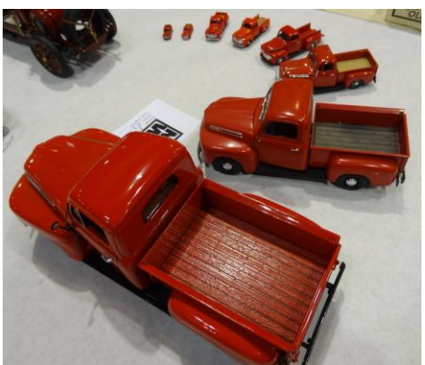
This colorful grouping captured what many displays were like, lively, varied with a signature character to them but nothing obvious beyond being very appealing,.