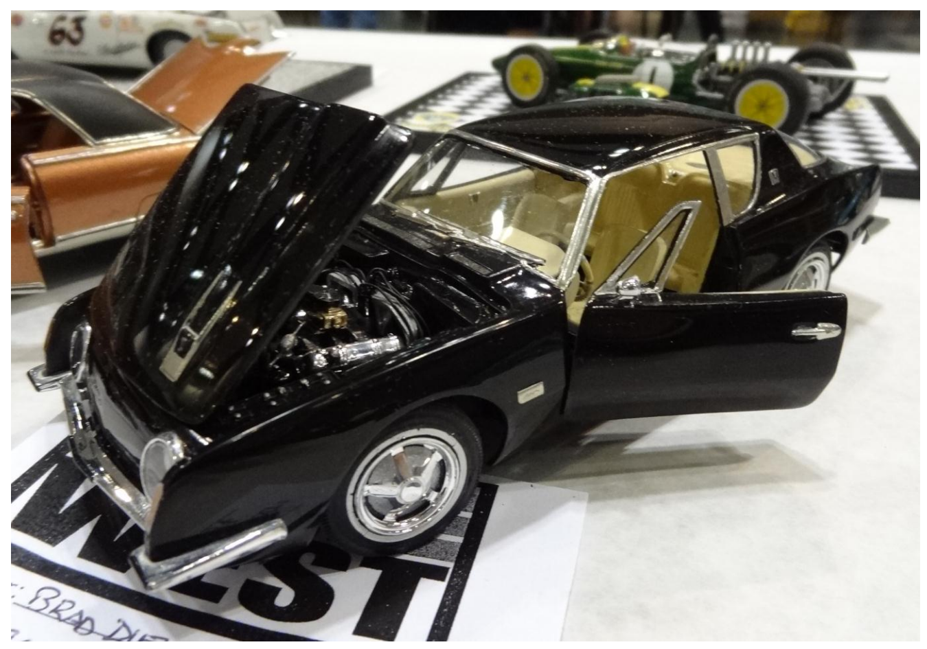
WHAT? NO 1963 SUPER THUNDER STING CAR showed up at the NNL event (continued from page 4)

Well, why not make it front and center, after all it's on theme and opened up for potential customer's viewing. A definite "revelatory" car design, the 1963 Studebaker Avanti elicits even when person didn't intend to voice it, an opinion of strong like or dislike. Not bad legacy for a man who is also lauded in the same period for being a brilliant shaper of refrigerators (Coldspot) and Coca Cola vend machines. Raymond Loewy, a hero of mine. Opine as you like about the relative beauty or utility of this American "personal luxury car", name another who survived a difficult birth that saw its parent company dissolve within its first year, was sold to two Indiana car dealers who began it's second life which thru a series of others, saw this basic design being produced into 2007. Below in foreground is the Avanti that punctuated on Utah salt flats the "presumed inflated" claim, wasn't that. Car with the dealer offered customer option of a Paxton supercharger like in this, you could see 160 MPH plus in this car. In background, another sight of the Turbine, a classic aqua 1963 Karmann Ghia and another Vette!