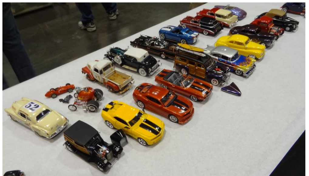
Of course, there was plenty beyond the 1963 themed. A very useful and intriguing display was this one with a "simple red Pickup" but in a descending scale cascade