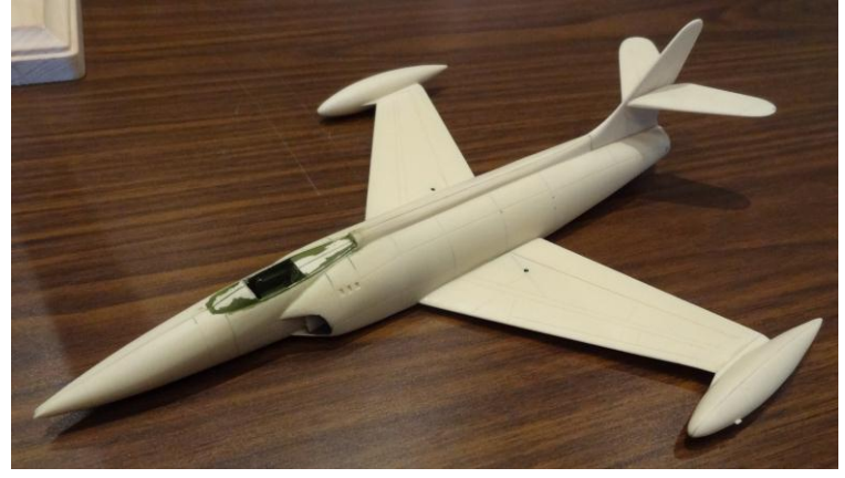
Frank Babbitt is tackling Anigrand's 1:72 Lockheed XF-90, and he's promised to make it as a real-life test article and not as one of the Blackhawk's fighters!

Mike Schwarze is sculpting a star spawn of Cthulu, which he plans on placing in a diorama, crushing the Massachusetts countryside! It's 1:60, to match the scale of the building model it will be destroying.